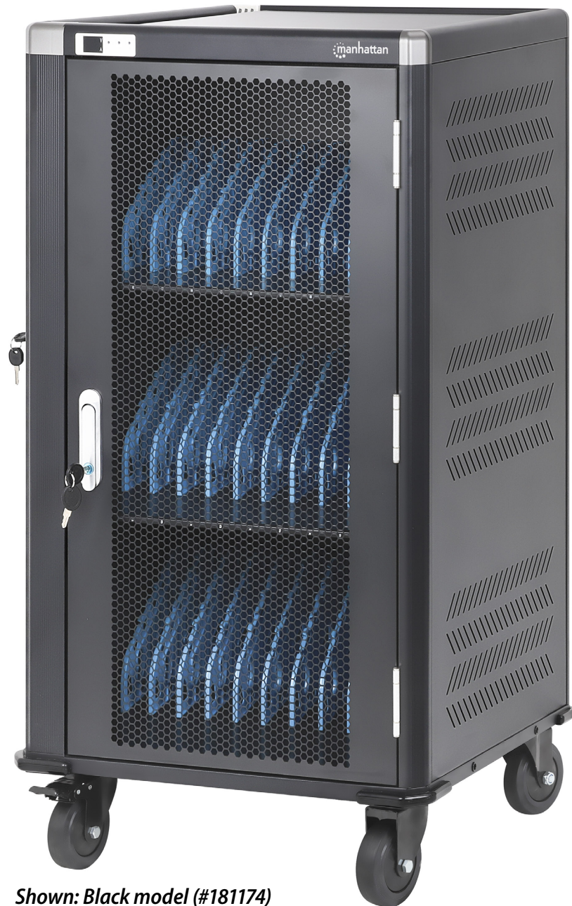
Shown: Black model (#181174)