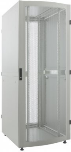
42U shown color: Gray shown