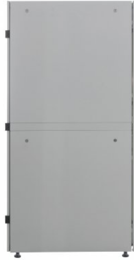
42U shown color: Gray shown