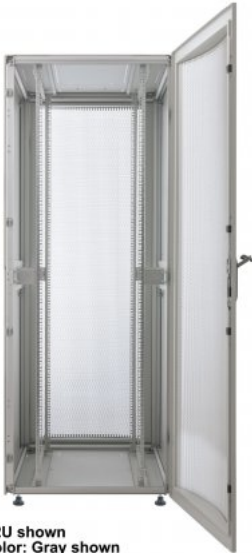
42U shown color: Gray shown