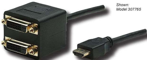
Shown: Model 307765

Thank you for purchasing one of a variety of MANHATTAN® Video Splitter Cables, each designed to provide quick and easy 2-to-1 connections for crystal-clear video transmissions. Each cable in this series supports high-resolution images for dual-display presentations delivered by a single source. (See the connector configuration chart with specs on the back of this guide.)