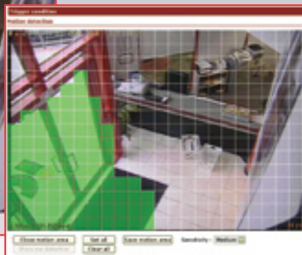
Motion detection grid