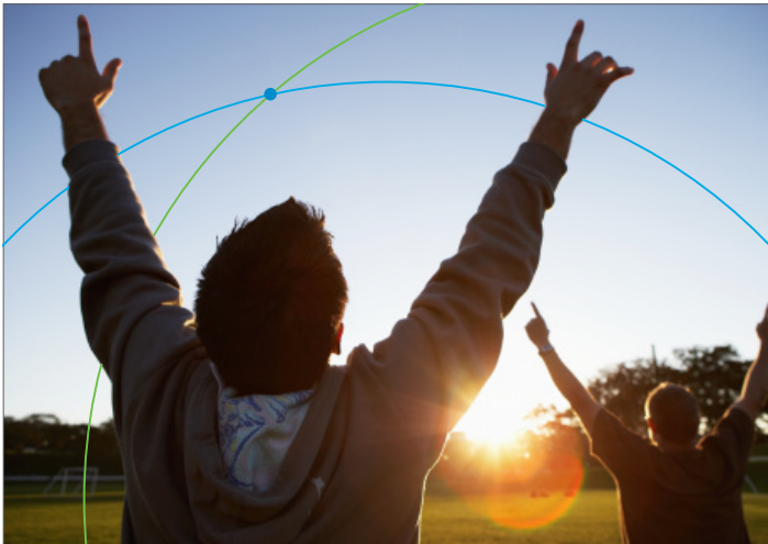
Option 6—with treatment