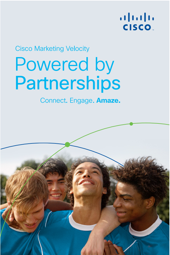
Collateral Cover Sheet