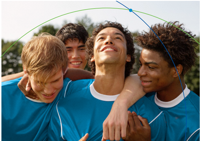
Option 5—with treatment