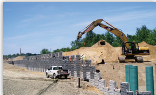
St. Rt. 8