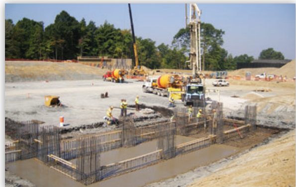
Tri-Point Medical Center