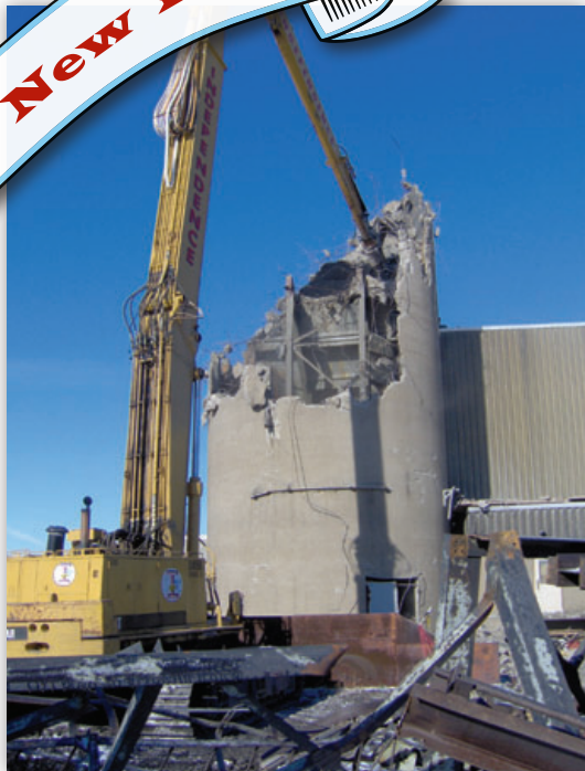
Visteon Silo Demolition