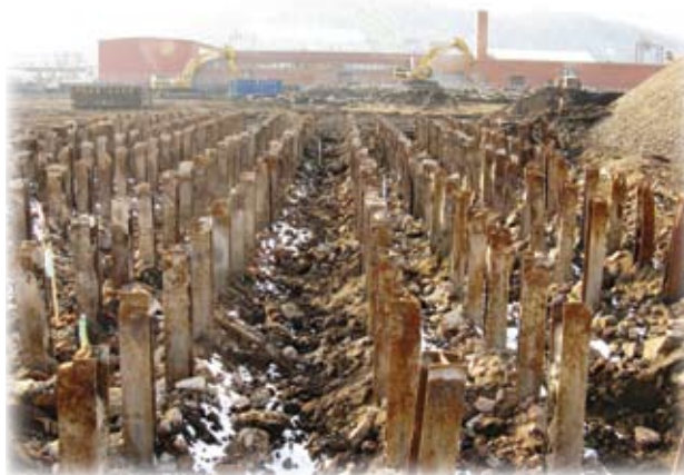
Section of H-pile to be removed.

working rather than wait for the subgrade to be remediated. The erection of the building will begin mid-April and our work on site will continue for several more months. Independence Excavating is proud to be part of this project and we look forward to the opening in May of 2009!