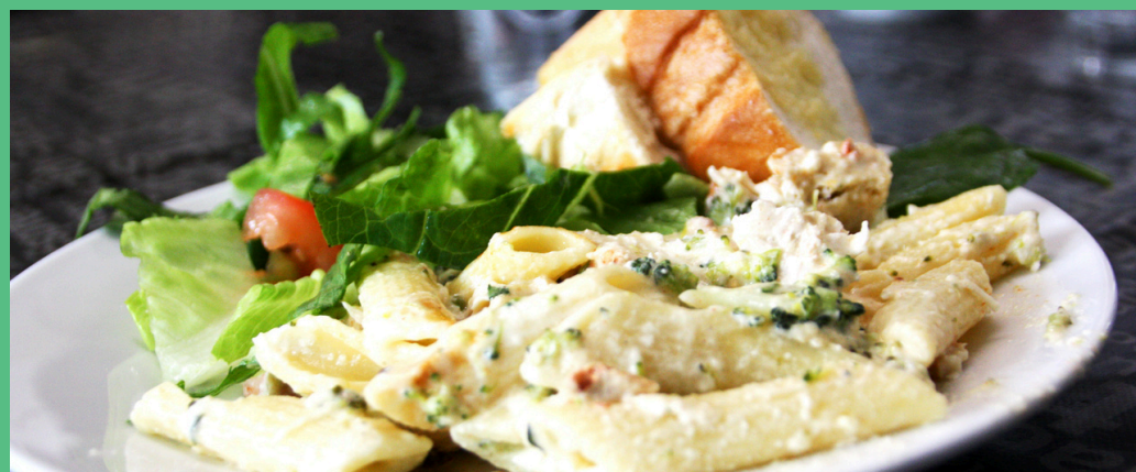
Delicious lunch served at Laneway Lunch, Bridge Darebin

This project is proudly supported by the Darebin City Council.