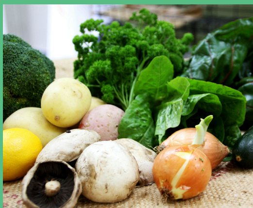
Fresh fruit and veg from a food parcel at DIVRS.