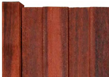
Board on Board (private)