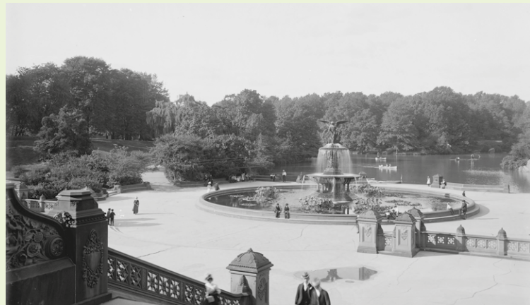
Bethesda Fountain, circa 1901.