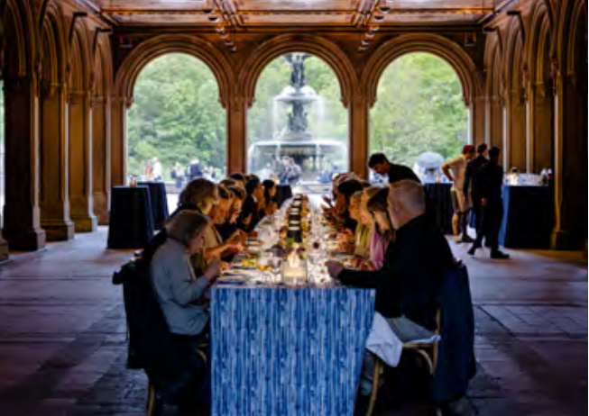
Starlight Dinner guests enjoying the evening