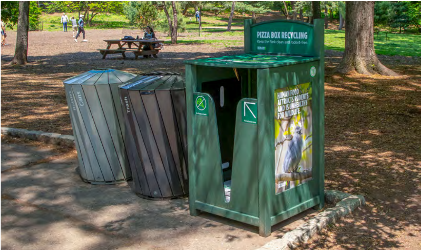
Waste receptacles near the Great Lawn