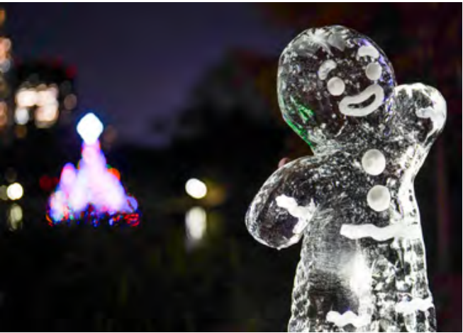
Gingerbread cookie ice sculpture