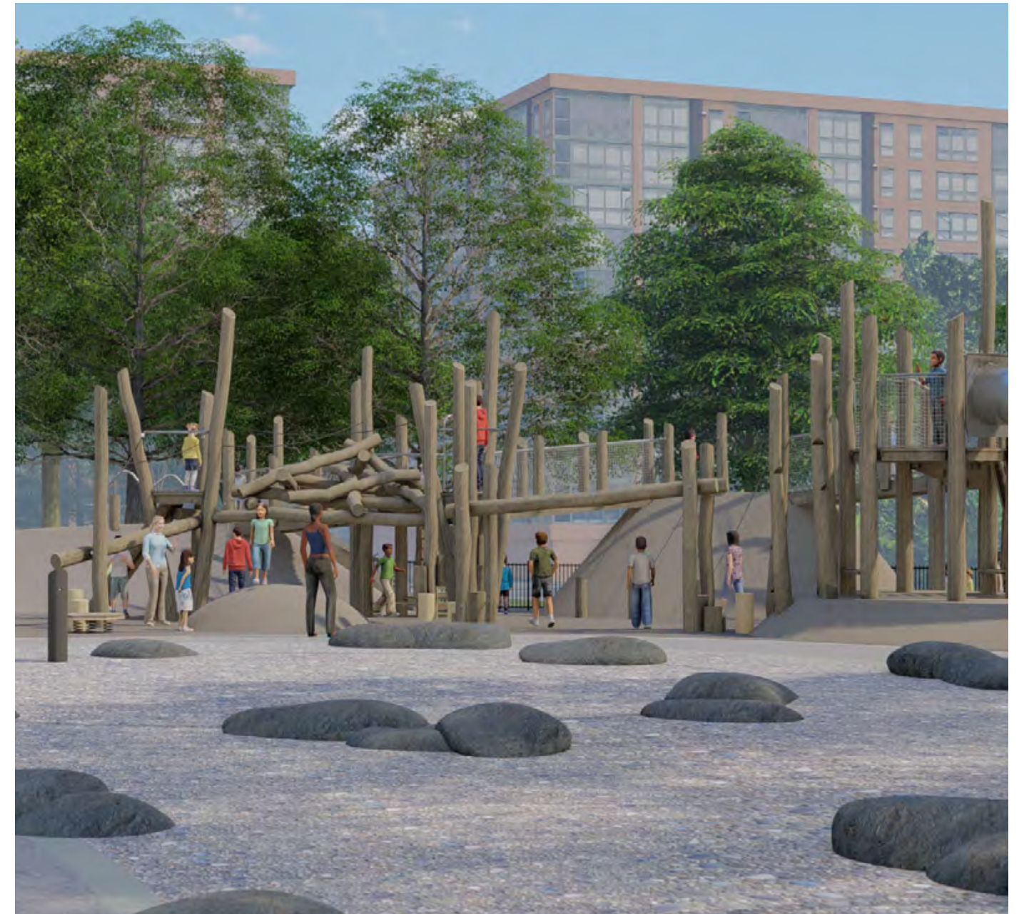
Current rendering of the playground

This Playground site is of particular significance due to its location at the historic center of Seneca Village, a site that, prior to the creation of Central Park, was home to a thriving community of African American property owners. The playground's design responds and relates to the enduring aspects of the surrounding landscape, including the mature trees and rock outcroppings. As the only playground in the Park designed exclusively for the 5- to 12-year old age group, West 85th Street Playground will create a challenging yet accessible play environment that meets current standards for safety. Currently in procurement, construction is targeted to begin in winter 2024/2025.