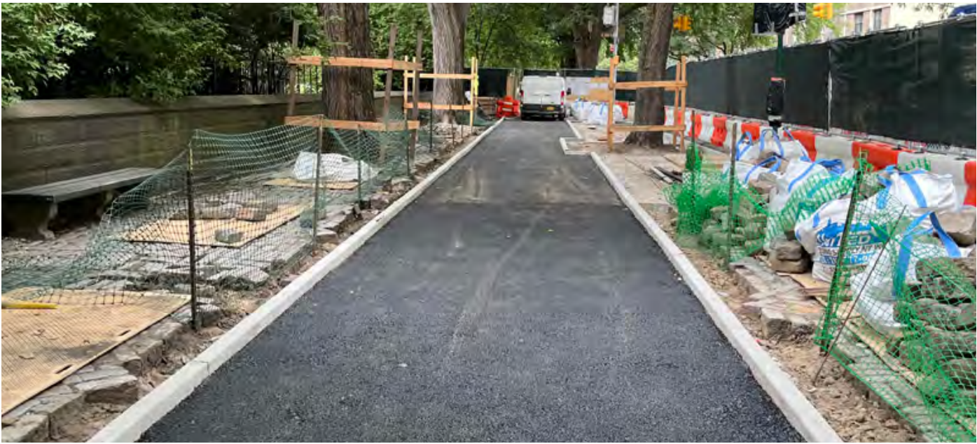
Construction at the Park Perimeter between East 104th and 106th Streets