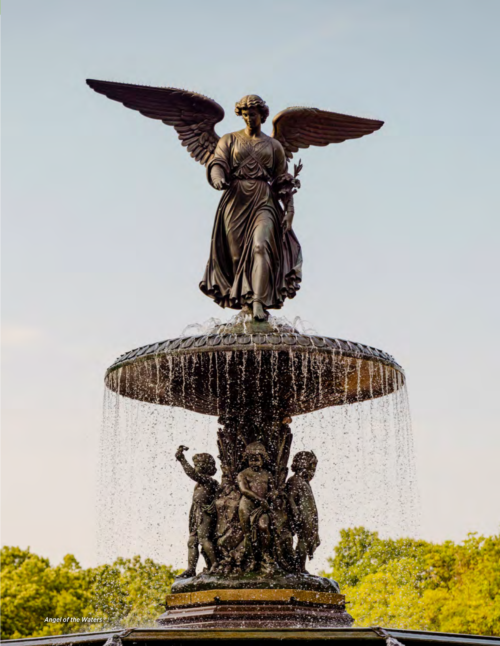
Angel of the Waters