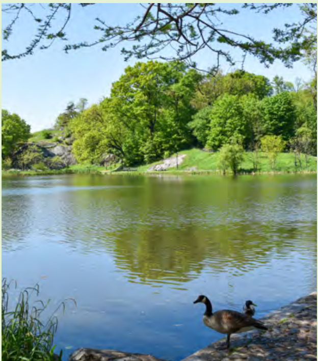
Existing condition of the Harlem Meer shoreline

This project will continue and build upon the work that the Central Park Conservancy has done to date in and around the Harlem Meer. These include the 1990s restoration of the Meer, the East 110th Street and East 108th Street playground projects, the ongoing Davis Center project, and the upcoming North End Recirculation system project. The restoration will include naturalizing and stabilizing the shoreline to its historic 19th century character, expanding the waterbody surface to support wildlife habitat, and improving accessibility access to the waterfront and Park programming at the Dana Center, the Davis Center, and the playgrounds. The shoreline restoration project is currently in design, with construction scheduled to begin in early 2025. This project will proceed in stages around the entire shoreline.