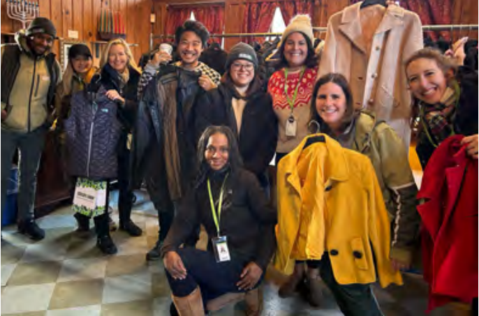
Above; top to bottom; left, right: Movie screening and discussion of Rustin ; J.P. Morgan Corporate Challenge; Mets game; Speed Colleagueing; Softball game; Coat drive.