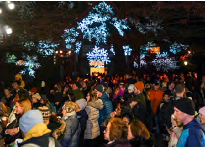
Families waiting for the lighting of the flotilla