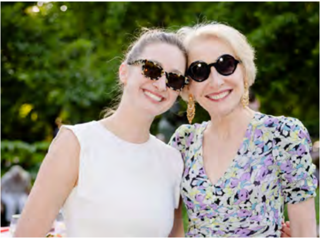
Guests enjoying summer in the English Garden