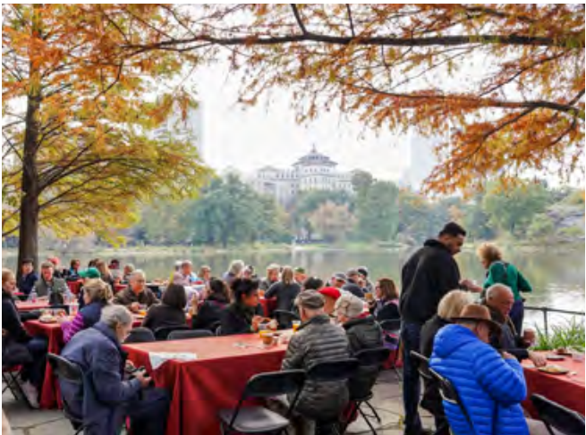
Breakfast under the fall foliage