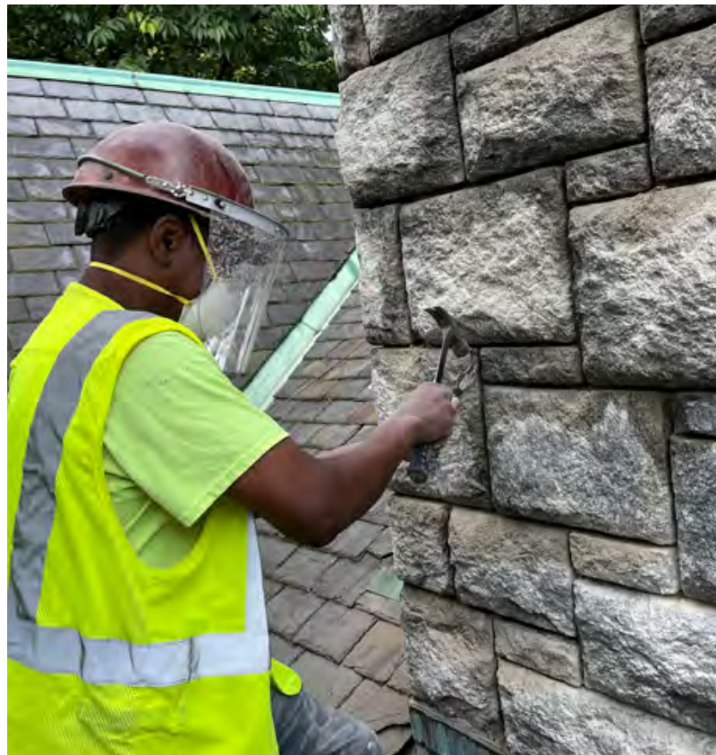
Façade restoration of masonry at Delacorte Restrooms building