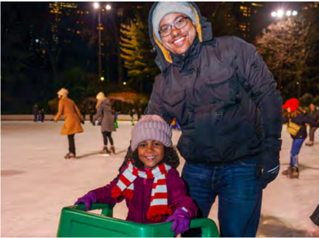
A family on the ice