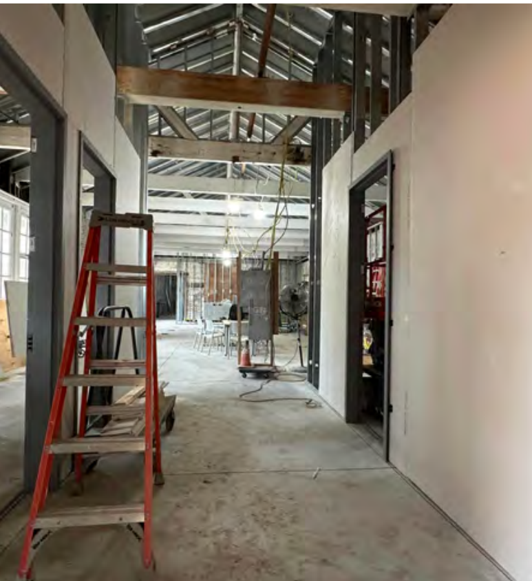
Interior view of North Meadow Center in construction

In tandem with the Public Theater's revitalization of the Delacorte Theater, the Conservancy began reconstructing the Delacorte public restrooms this summer. The full core and shell restoration of the restrooms will greatly increase energy efficiency and water conservation in the building. Scope includes façade cleaning and repairs, new windows and doors based on historic photographs, roof replacement, all new mechanical, electrical, and plumbing systems, and improvements to restroom accessibility. We are also increasing the fixture count in the women's room to accommodate more Park visitors. Target construction completion is summer 2025.