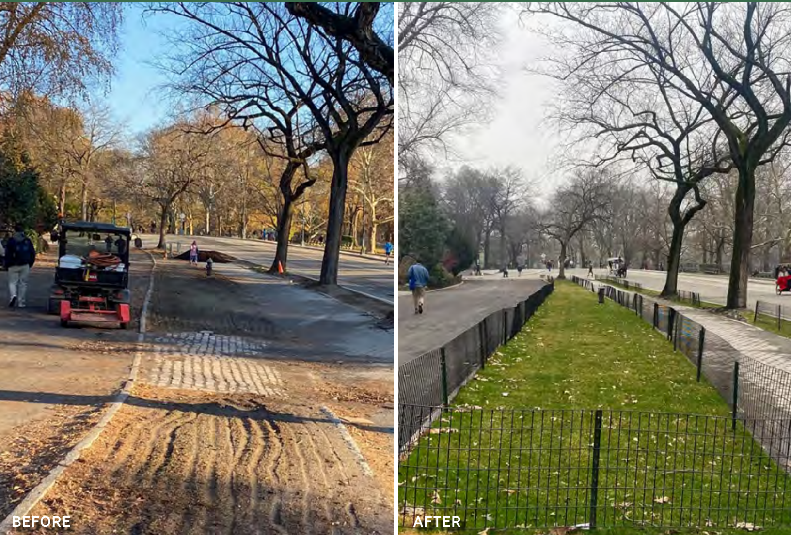
Restoration of the landscape between the bridle path and the West Drive