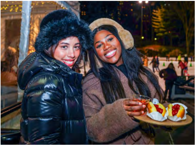
Friends enjoying refreshments