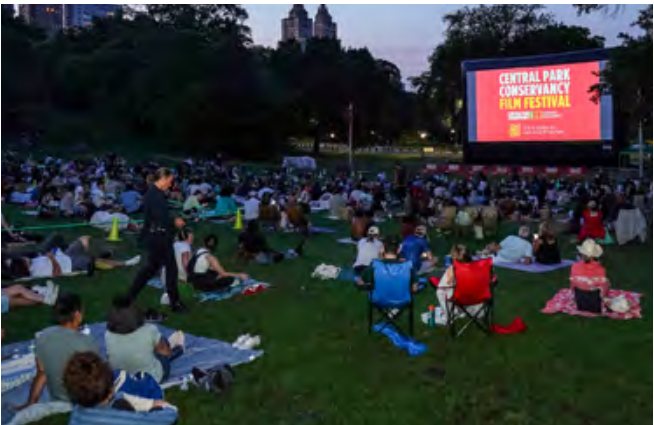
Guests waiting for the film to begin

Presented by National Geographic Documentary Films