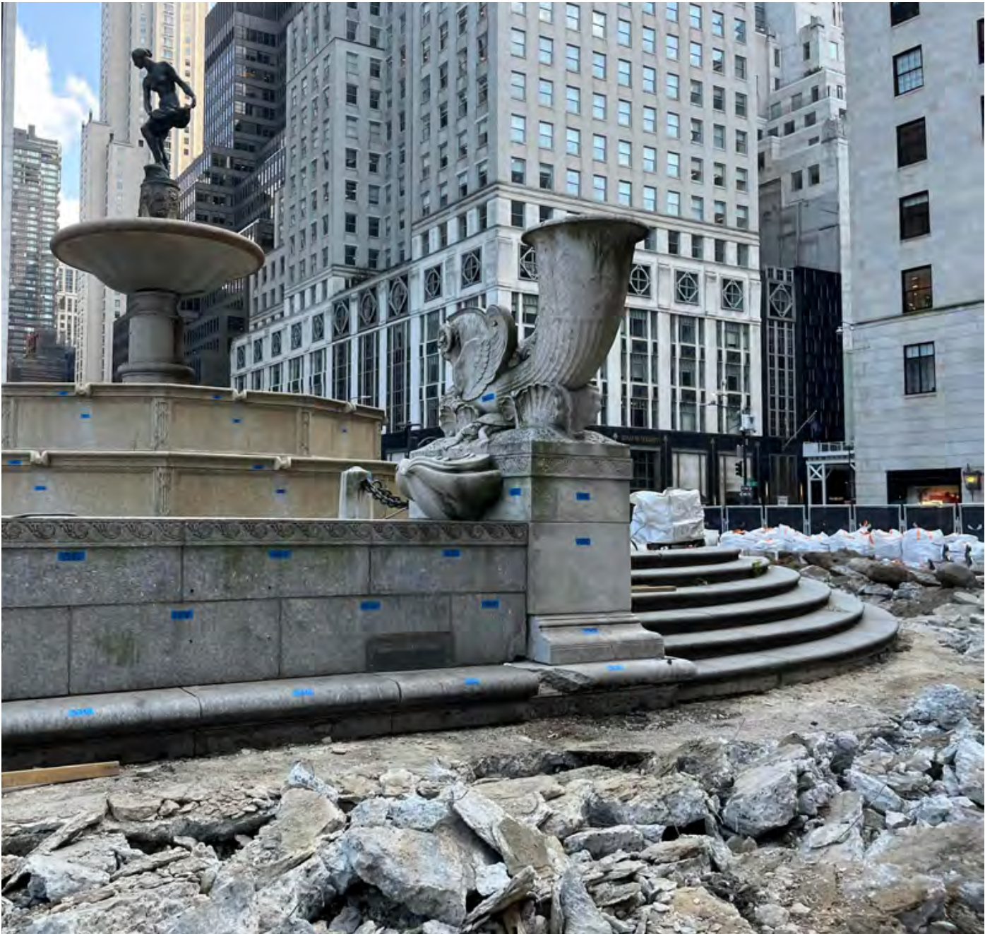
Construction at Grand Army Plaza South

Following the 2015 restoration of Grand Army Plaza’s north side, the Conservancy began a full restoration of the south side this spring. The project includes repairing and replacing deteriorated pavements consistent with the original plaza design, creating an accessible entrance to the plaza’s interior, transitioning the current trees to a double row of historically appropriate London plane trees, and conserving Pulitzer Fountain to ensure the long-term stewardship of this landmark feature. Work is expected to be completed by the end of 2025.