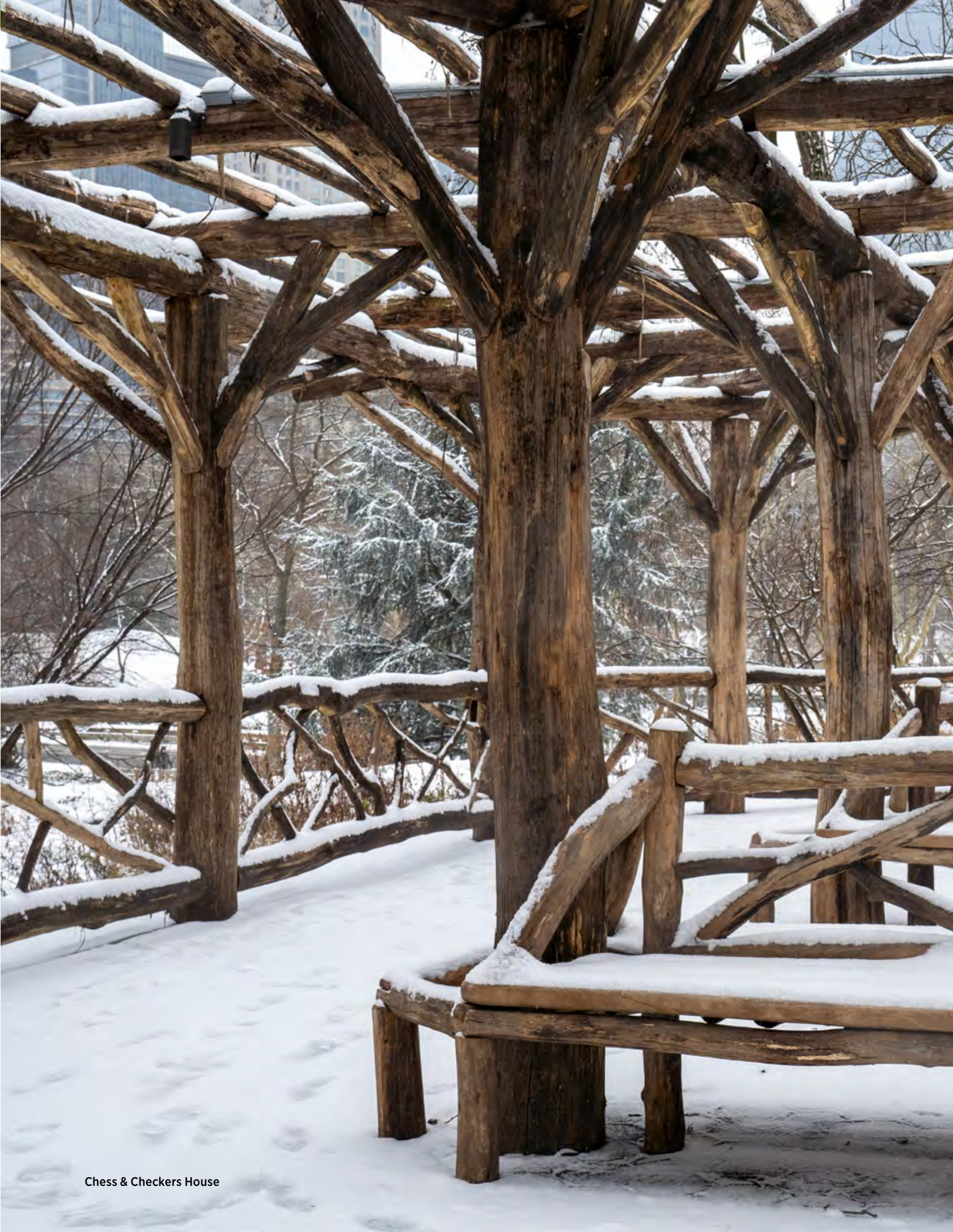
Chess & Checkers House