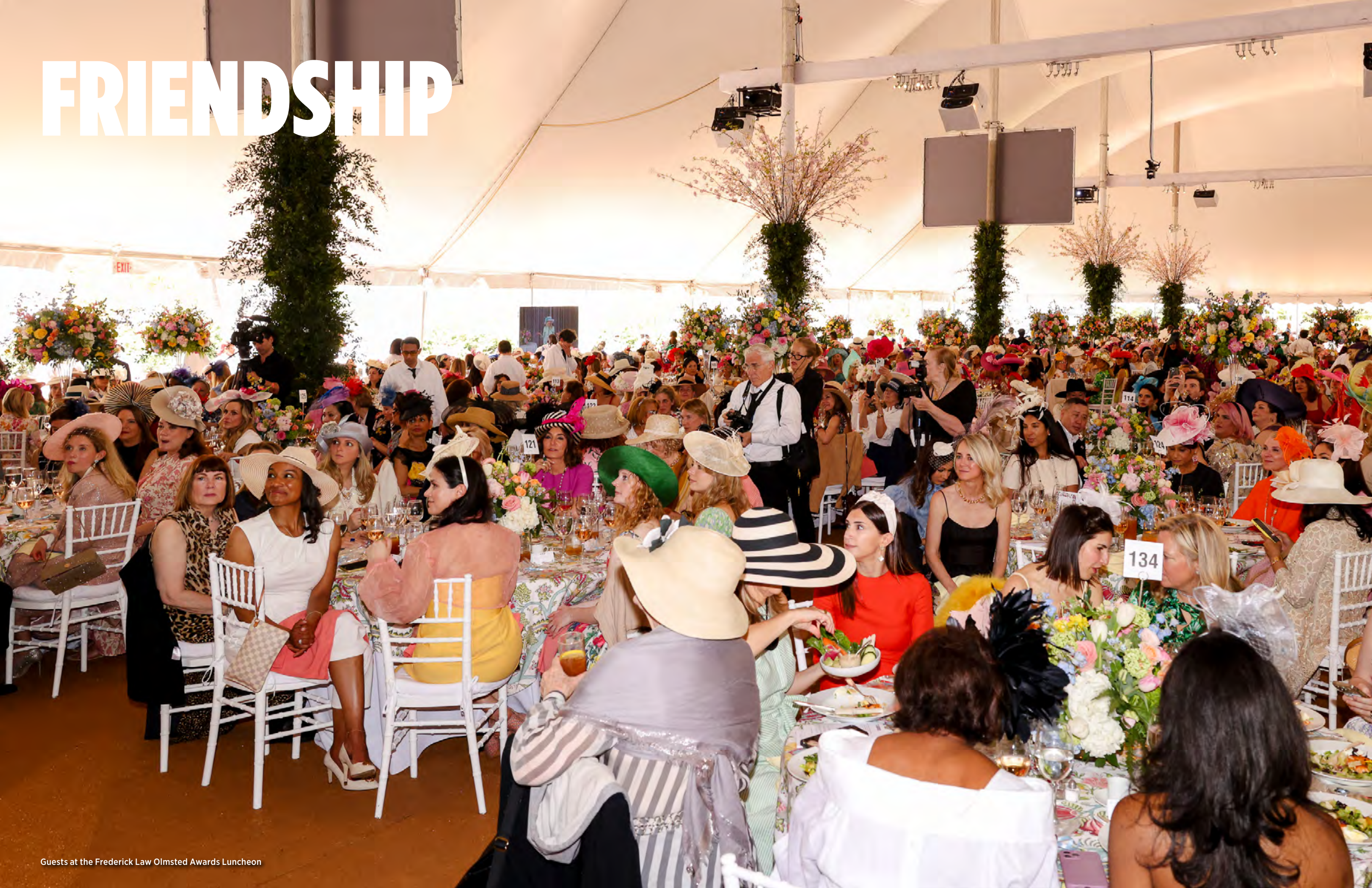
Guests at the Frederick Law Olmsted Awards Luncheon