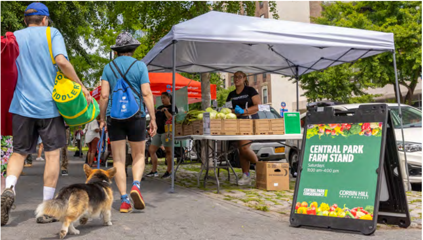
Launch of the Central Park Farm Stand

As part of our commitment to addressing accessibility concerns within Central Park, we have modified our popular Heart of the Park Tour to ensure it is mobility-friendly for individuals using strollers, walkers, or wheelchairs. This unique tour provides access to some of the Park's most iconic locations, including Strawberry Fields, Bethesda Terrace, and the Alice in Wonderland statue, all within a concise 60-minute experience.