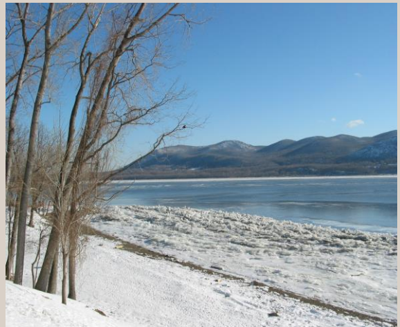
THE HUDSON RIVER

----- NYSDEC: New York State Department of Environmental Conservation EPA: Environmental Protection Agency DOE: Department of Energy