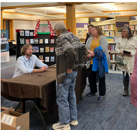
Dormann Library in Bath, NY