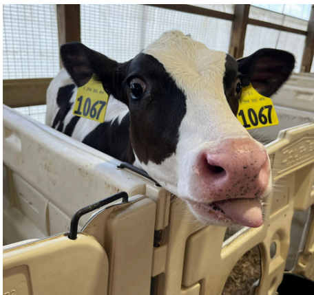
Smith's Stock Farms in Howard, NY

The Southwest NY Dairy, Livestock and Field Crops Program (SWNYDLFC) is a partnership between Cornell University and the Cornell Cooperative Extension Associations of Allegany, Cattaraugus, Chautauqua, Erie, and Steuben counties. In 2025 the program conducted 1,544 farm consultations in the areas of farm business management, field crops, dairy management, and livestock production. In Steuben County, the SWNYDLFC team held several events in 2025 including a hands-on workshop on internal parasite management for sheep and goat farmers. They also held a mortality composting training in collaboration with Steuben County Soil and Water, CCE Steuben, and the Cornell Waste Management Institute.