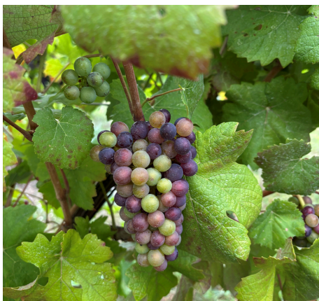
Ryan Vineyards in Pulteney, NY

The Finger Lakes Grape Program (FLGP) is a partnership between Cornell University and CCE Associations in six counties in the Finger Lakes region. In 2025, the FLGP held a series of grower meetings around the Finger Lakes region from May through August. The series kicked off with the Spring Grape IPM Meeting held at Doyle Vineyard Management in Hammondsport, NY. The nearly 100 growers who attended heard talks on insect and disease management. This spring, the FLGP was also awarded three grants funded by the New York Wine & Grape Foundation for research projects conducted between April 1, 2025 and March 31, 2026.