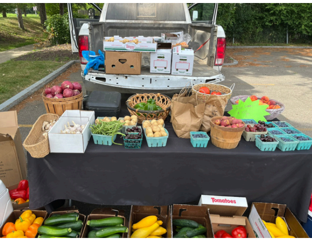
A Veggie Van stop with Lowery Family Farms at Guthrie Corning Centerway offers a wide variety of local produce.