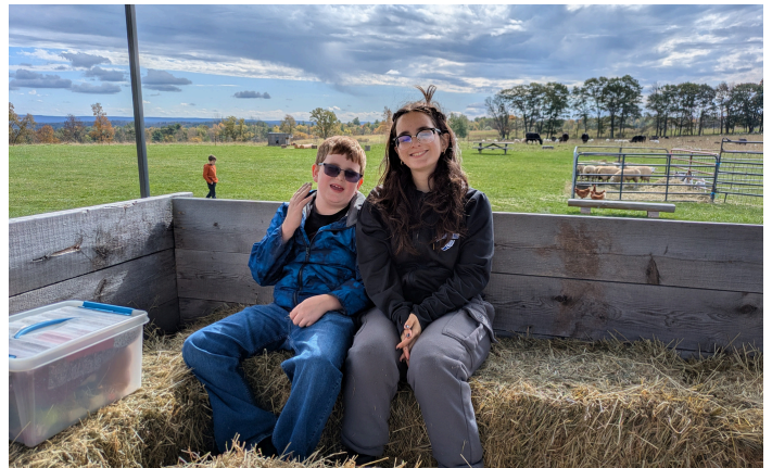
Evermore Farms in Lindley, NY

In October, CCE Steuben hosted its fourth annual Farm Trail Day event. This year we expanded to include 15 Steuben County farms and agribusinesses as stops, the most the event has ever had. Made possible through a grant from Explore Steuben, this year's event included informational hayrides, a goat milk soap making demonstration, hands-on apple cider making, grape vine wreath making, tool identification, and sampling of local farm products. We received positive feedback from community members who participated including one woman who when dropping off her completed farm passport said it was the best thing she had done with her grandchildren.