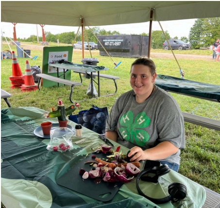
Hendershot Haflingers in Cameron Mills, NY

This year, Steuben County 4-H held their second annual Summer Showcase event for Steuben County 4-H youth, families, and community members. Over the three-day event 101 youth exhibitors participated in a wide variety of activities ranging from animal showmanship and sport to flower arranging and cake decorating. There were over 1,100 entries at the event including animal entries, static projects, and youth contests. The evening of Friday, July 25 Empire Livestock ran the annual 4-H Market Sale where buyers came to purchase animals and baked goods that 4-H youth have been working hard on all year. In addition to this livestock and baked goods auction, 4-H members had the opportunity to sell products that they made at the 4-H Maker's Market Friday afternoon. Items sold included jewelry, 3-D printed keychains, canned goods such as salsa, wood burning pieces, and more.