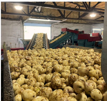
Squires Produce in Prattsburgh, NY

The Cornell Vegetable Program (CVP) is a Cornell Cooperative Extension partnership between Cornell University and County Associations in 14 counties. In 2025, CVP Specialists conducted 4,752 farm visits and consultations across the 14 county region. Steuben County is one of New York State's top potato producing counties. CVP Specialists planted a potato variety trial test during the growing season in 2025 to test the yields of several potato varieties. Through the trial they found Baltic Rose, a red potato with yellow flesh, to have the highest yield in 2025 while the russet varieties had a harder time withstanding the high temperatures and low rainfall of the 2025 growing season.