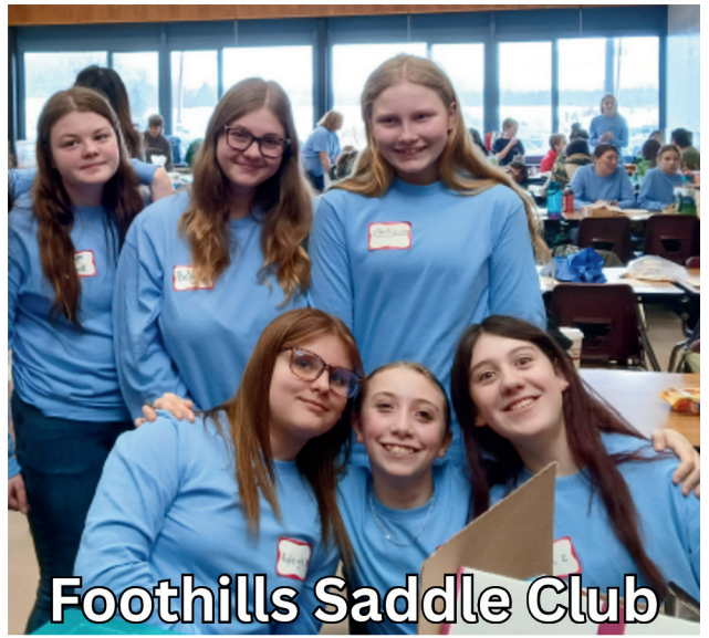
Foothills Saddle Club