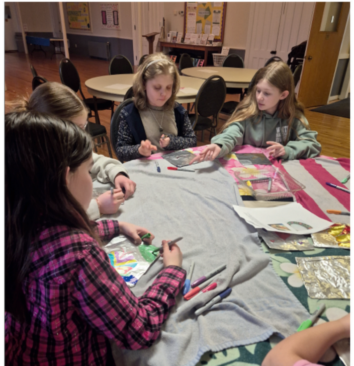
Cool Cooking Crafters