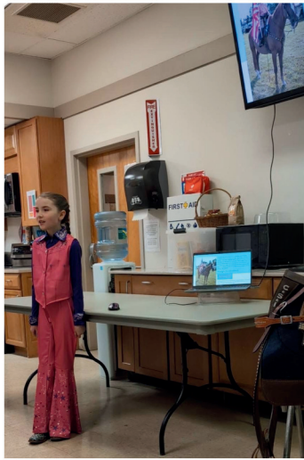
Oneida County Equine