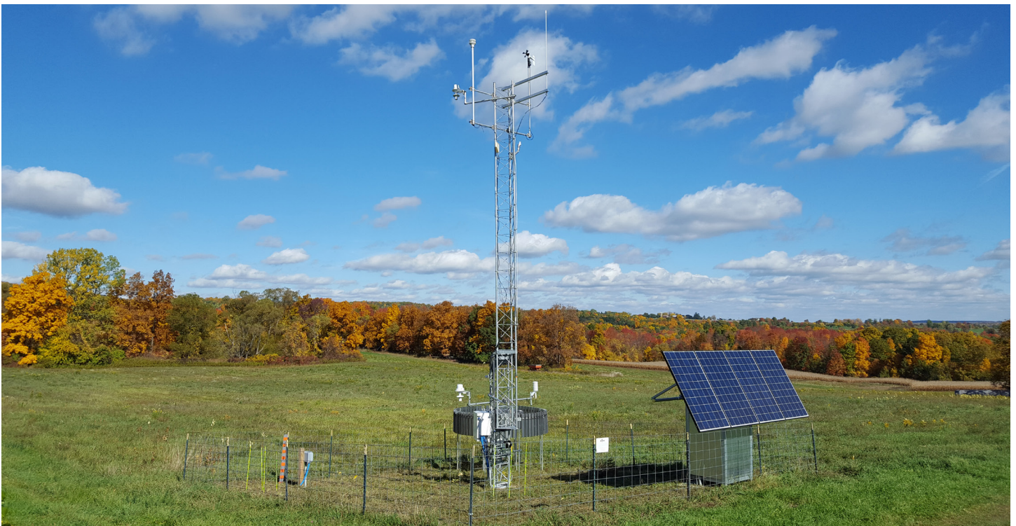
The Mesonet weather station at Randall Standish Vineyards in South Bristol.

In April, 2018, the weather data from the South Bristol station finally started streaming into the NEWA system. This now allows growers along Canandaigua Lake to have a localized and reliable source of weather data that is being made more accessible and useful for them. Having more relevant weather data allows these growers to better understand the impacts of winter cold temperatures on their pruning strategy for the winter, for example, and how the weather is affecting insect populations and disease development in their specific location. The FLGP is continuing to educate growers on ways to use the data from NEWA that will improve their vineyard operations, and this new source of data will be a useful tool in that effort.