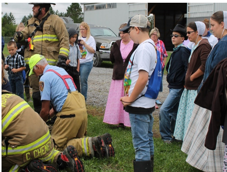
Participants watch as rescue crews demonstrate Cardio Pulmonary Resuscitation (CPR) techniques at Progressive Agriculture Safety Day.

Participants watched as a dummy was entangled in an unguarded PTO shaft and learned about tractor rollovers from a tabletop demonstration. Rollovers are the leading cause