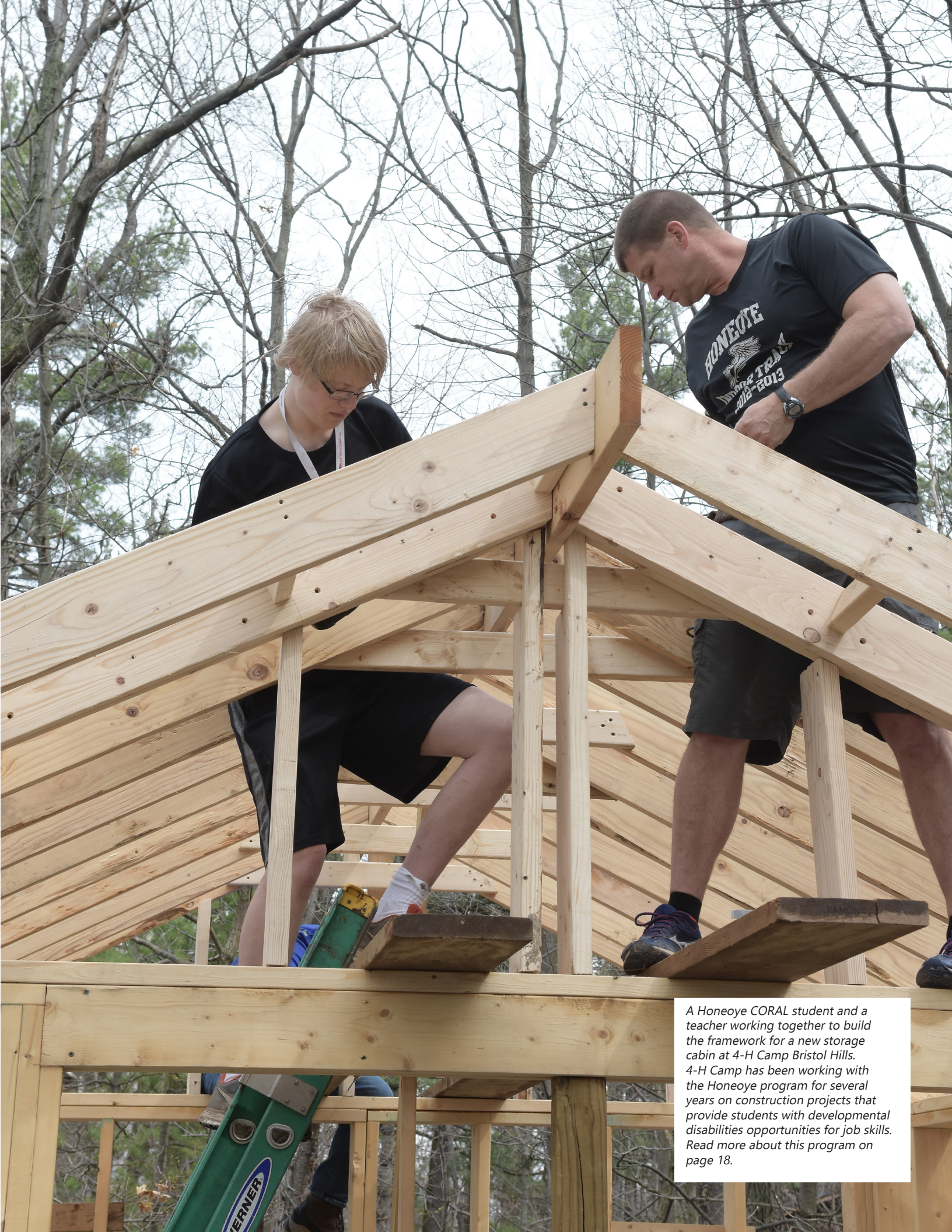
A Honeoye CORAL student and a teacher working together to build the framework for a new storage cabin at 4-H Camp Bristol Hills. 4-H Camp has been working with the Honeoye program for several years on construction projects that provide students with developmental disabilities opportunities for job skills. Read more about this program on page 18.