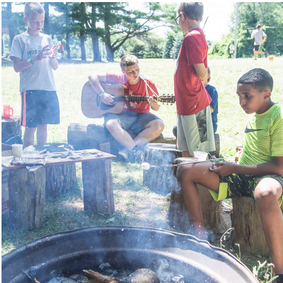
Campers's enjoying some time at the campfire, playing guitar, singing, and roasting marshmallows. With support from the Disney Corporation, camp has been supporting 75 campers from urban environments (Rochester and New York City) for each of the past four summers.

Since 1925, Cornell Cooperative Extension of Ontario County has operated 4-H Camp Bristol Hills, providing positive outdoor experiences for youth. For many years, Camp has received donations from organizations including the Ontario County Youth Bureau, the Disney Corporation, local farms, and many others, as well as from individual donors, to help extend the summer camp experience to families with limited financial resources. Several years ago, with requests for financial aid from camp families growing, camp instituted the Hilltop Fund. This dedicated fund is distributed directly to families in need, by way of discounted camp enrollment fees. Many recipients of these funds are awarded full camperships, allowing them to attend camp at no cost. Others recipients receive a partial campership, where the family is financially responsible for a small portion of the camp fees. Distribution of these funds is based on perceived benefit to the child, as well as financial need. A small campership selection committee annually reviews over 200 requests for Hilltop Funds, and the generosity of our community has typically allowed us to accommodate nearly 75% of these requests for either full or partial campership support. In 2018, 151 campers received support to attend camp.