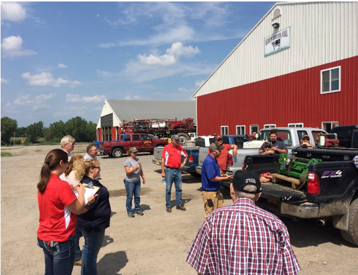
Participants learned of the benefits of putting up a high quality crop, and the steps to reach quality and yield goals. They were also encouraged to consider the short and long-term economics of corn silage cutting height, additional packing tractor weight, kernel processing score, and inoculant use.

inoculant use. Abundant farmer to farmer discussion was valuable in sharing experiences with different equipment and technologies, with highlights including learning from each host farm's harvest practices, as well as seeing and exploring the different aspects of each farm's kernel processor. Participants left feeling better prepared for the 2018 corn silage harvest, aware of the impact their decisions have on the farm's success, and thinking about improvements to be made in the years to come.