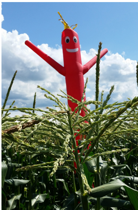
Bird deterrents, like this air-dancer, were tested for impacts on bird activity on the farm, specific bird activity at each field location, crop maturity at application, and damage at harvest.

Bird damage continues to wreak havoc in sweet corn. CVP fresh market specialists Darcy Telenko and Robert Hadad, along with NYS IPM specialist Marion Zuefle partnered with six vegetable farms in central and