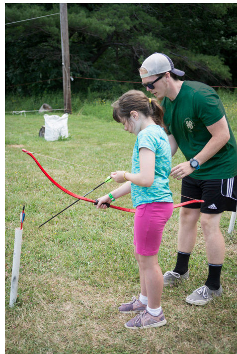
For many campers, their time at 4-H Camp Bristol Hills may be their first time tossing a fishing line, or trying out the bow and arrow course.