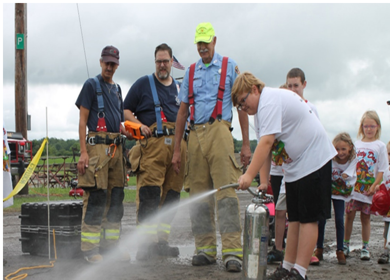
Youth getting a chance to use a fire extinguisher to put out a diesel fire.