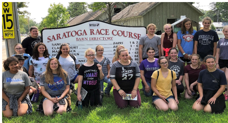
4-H members get a behind-the-scenes tour at the Saratoga Race Course as part of their Equine Careers Program.