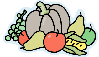
Exhibit the Right Number.

Plan to exhibit the exact number of vegetables called for. Check the Fair Book, as the number may differ with various fairs.