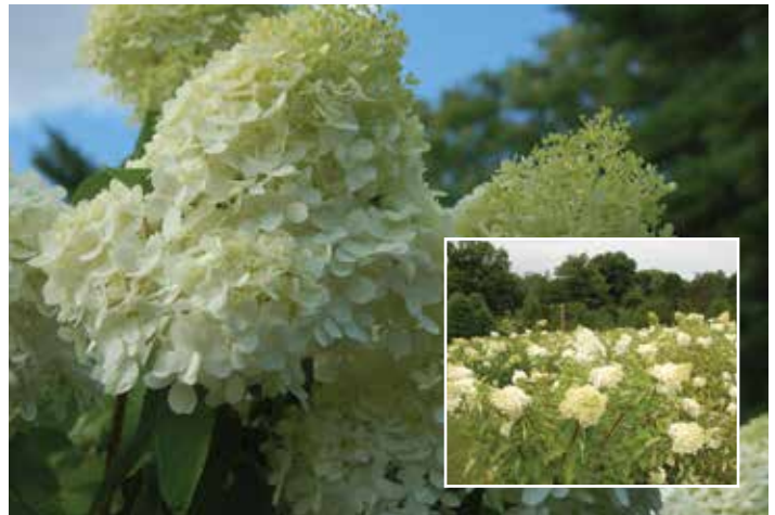
Hydrangea paniculata 'Limelight' (Limelight Hydrangea)

Serrated Japanese aucuba fills a niche as one of the premier broadleaf evergreen shrubs for light to deep shade. Foliage remains pristine through most of Long Island winters especially when the plants are sited out of winter sun and wind. The shrub will grow 6-8 feet tall and functions well as a hedge, or as a component of the woodland shrub border. Pruning is handled well and the species is moderately tolerant of salt spray and poor soil as long as drainage is good. It is a suitable alternative to Prunus laurocerasus 'Schipkaensis' (Skip Laurel) without the foliage problems.