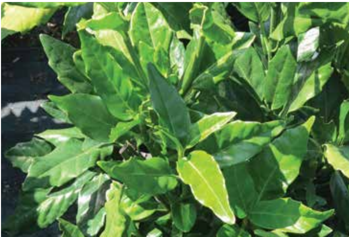
Aucuba japonica 'Serratifolia' (Serrated Japanese Aucuba)

Serrated Japanese aucuba fills a niche as one of the premier broadleaf evergreen shrubs for light to deep shade. Foliage remains pristine through most of Long Island winters especially when the plants are sited out of winter sun and wind. The shrub will grow 6-8 feet tall and functions well as a hedge, or as a component of the woodland shrub border. Pruning is handled well and the species is moderately tolerant of salt spray and poor soil as long as drainage is good. It is a suitable alternative to Prunus laurocerasus 'Schipkaensis' (Skip Laurel) without the foliage problems.