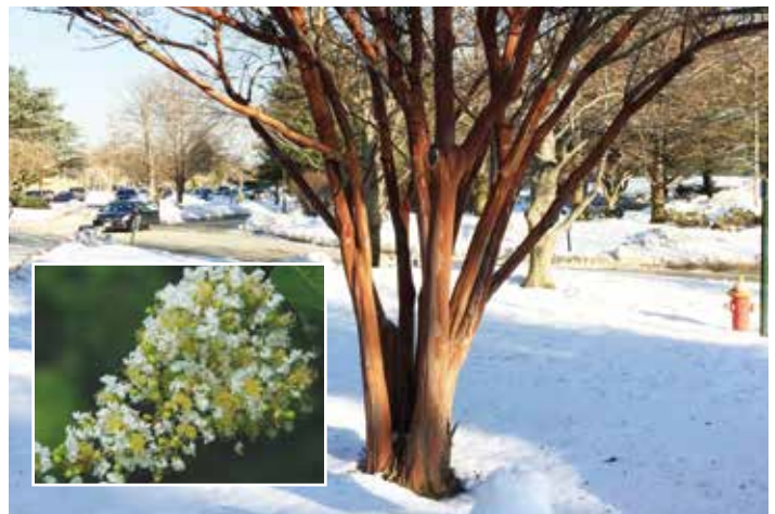
Lagerstroemia indica x faurieri 'Natchez' (Natchez Crape myrtle)

The long-blooming nature and reliability of this hardy perennial make it a workhorse of the garden. This wildflower works en masse, as a specimen planting in a mixed border, or in a container garden. The 3" diameter, canary-yellow flowers begin to show in early summer, with rebloom in fall if sheared. Tickseed has a graceful mounding habit reaching 16-20 inches and 18-24 inches wide. Full sun and average moisture are preferred, although poor soils and drought are tolerated once established.