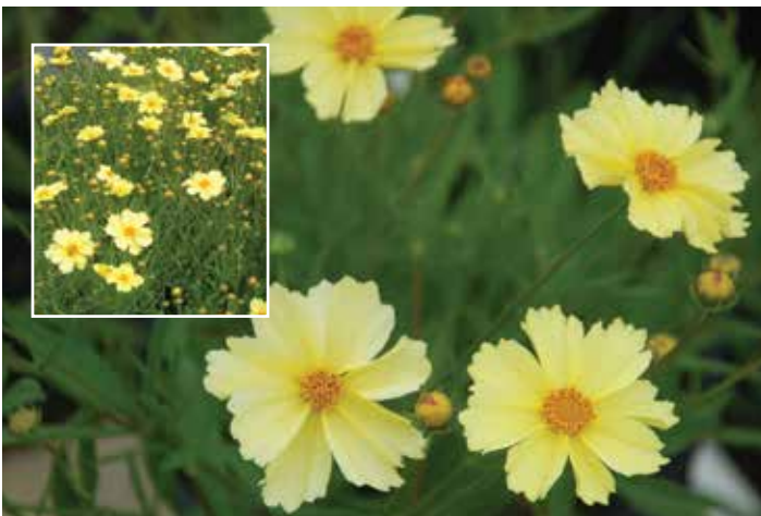
Coreopsis 'Full Moon' Big Bang™ (Full Moon Tickseed)

Limelight hydrangea is a much-loved deciduous shrub for its strong upright form, winter hardiness, and profuse display of flowers throughout the season. The large panicle flowers are borne on new growth and change from hues of lime green to white and mature to a soft pink. Planted as a singular planting in a mixed border or as an informal hedge, the effect in bloom is dramatic. A shrub grows 6 to 10 feet tall and about 5 feet wide in full or part sun with well-drained soil preferred. In spring, prune back to strong lateral buds to maintain growth and vigor.