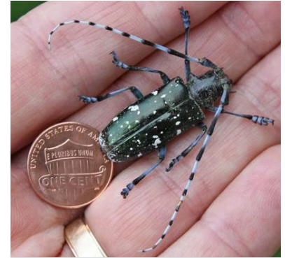
An adult ALB