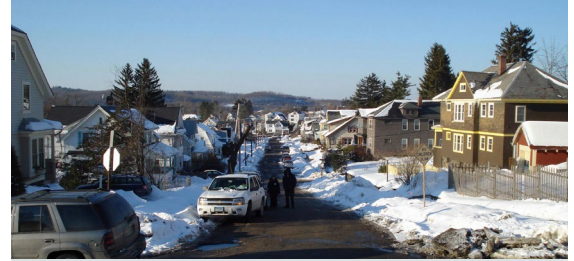
Before and after the removal of ALB infested trees in Worcester, MA.