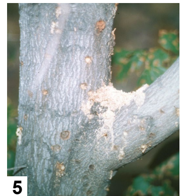
5