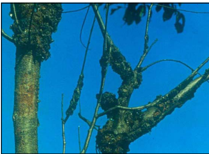
Figure 2: Galls caused by the fungus on cherry.

The disease is characterized by the presence of thick, black, irregular swellings on the twigs (Fig. 1). The presence of these symptoms is often first noticed in the winter season when they are not obscured by leaves. However, the fungal disease-causing agent has been present for quite some time. The pathogen's presence disrupts the normal growth of the twigs and a tumor-like growth forms at the infection site. Infections may take place as much as a year or more prior to the development of these characteristic "knots", therefore, the swellings are normally not noticed until the winter of the second season of infection. It takes a keen observer to notice the subtle, initial symptoms present during the first season of infection.