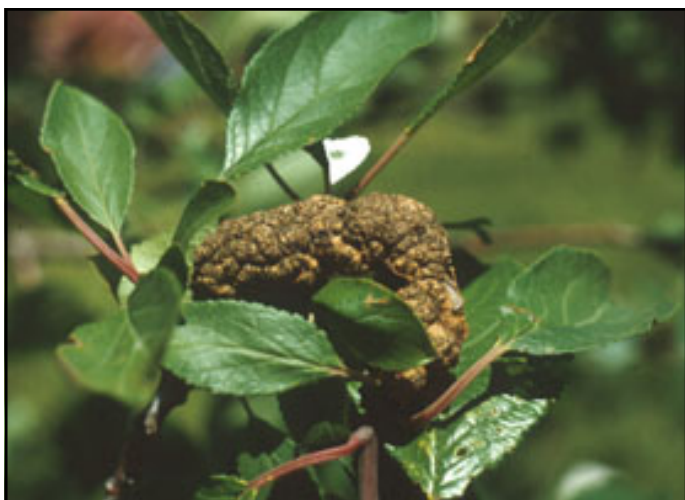
Figure 4. As knots develop, they become very soft in texture and are covered with olive-green conidia.

good time to look for and remove sources of inoculum in nearby wild Prunus spp. in hedgerows and woodlots. The knots are capable of producing ascospores for some time after removal from the tree. Therefore, they should be burned, buried, or removed from the site regardless of the time of year the pruning takes place.