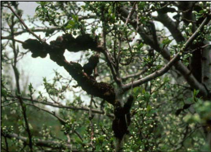
Figure 1: Branches appear thick and black.

Black knot disease occurs on numerous cultivated and wild plums, prunes, and cherries ( Prunus spp.). The disease is characterized by the presence of warty, black galls which may vary in size from 1/2 inch to more than 1 foot in length. In some parts of the Northeast and Midwest, black knot causes serious losses to commercial plum and prune growers. More often, however, the grotesque galls draw the attention from homeowners who want to improve the unsightly appearance of affected landscape trees.