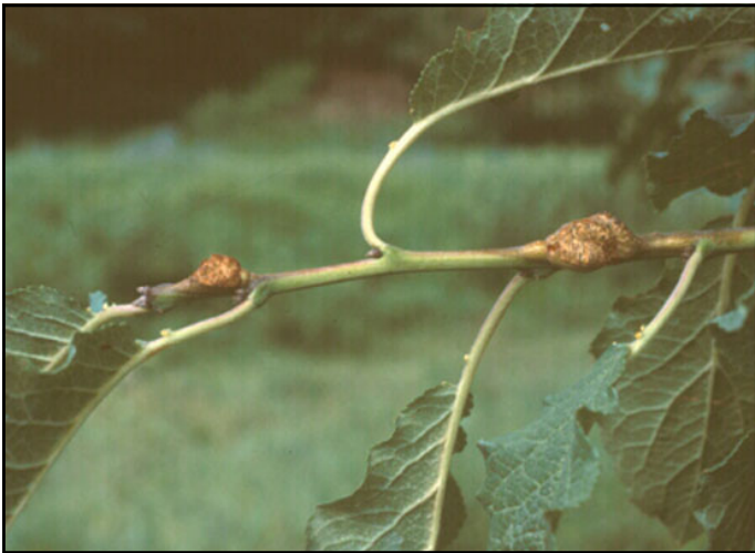
Figure 3. The early stages of knot formation result in only small galls. (provided by Dr. Phil A. Arneson, Cornell University)

The conidia are disseminated by wind and splashing rain but probably do not figure as prominently as the ascospores in establishing new infections. By the second summer after infection, the knots have enlarged considerably and begin to change to a hard,