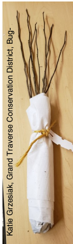
Katie Grzesiak, Grand Traverse Conservation District, Bug-