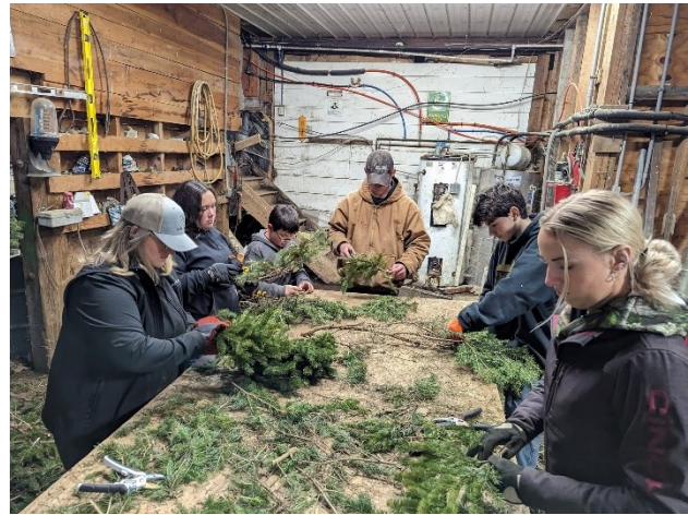
Teen Exchange Is Still Recruiting – looking for 7 th to 11 th graders.