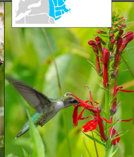
Highbush blueberry, ninebark, and cardinal flower

The Northeast Region encompasses southern Quebec, New Brunswick, Nova Scotia, the New England states, and eastern New York. High regional variation in topography, soils, and climate translates to tremendous ecological diversity, ranging from the coastal dunes and tidal ecosystems along the Atlantic shoreline, to the spectacularly species-rich deciduous forests and riparian communities of the Appalachian Highlands.