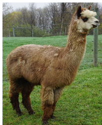
Lazy Acres Alpacas