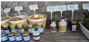
Collett Road Produce

Contact: 585-781-4933 or safritz.2@gmail.com