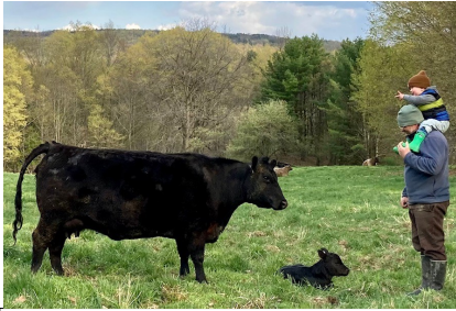
Sweet Grass Meats