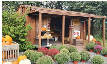
JD's Country Ridge Farm