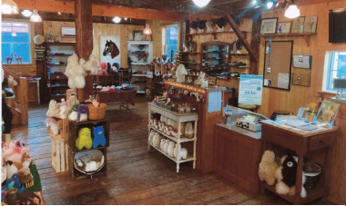
Lazy Acres Alpacas Store

Ontario County offers local products: A (Alpacas) to Z (Zucchini) and something for everyone!