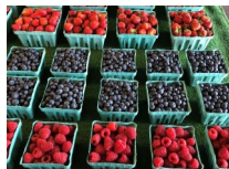
Joseph's Wayside Market