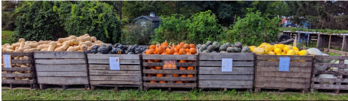
Schlenker Farm Market