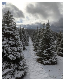
Hanggi's Christmas Tree Farm