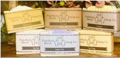
Padelford Brook Products