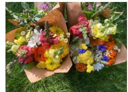
Locust Grove Flower Farm

https://www.facebook.com/profile.php?id=100084147678646