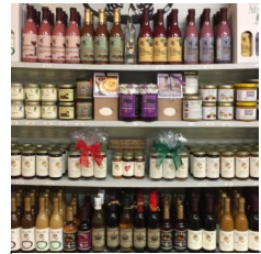
Arbor Hill Grapery