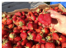
Fish Farm Market

Contact: 585-289-4215 or Lfish@dishbyfish.com www.fishfarmmarket.com