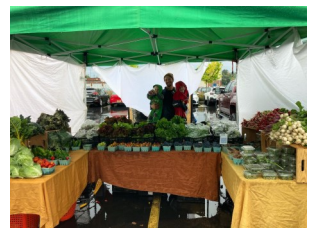
Schenk Homestead Farm