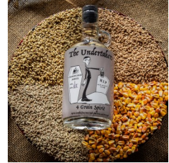
Smokin' Tails Distillery