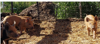
Washburn Produce and Poultry

Contact: 585-229-4925 or washburn_poultry@yahoo.com