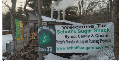
Schoff's Sugar Shack