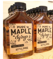
Kettle Ridge Farm