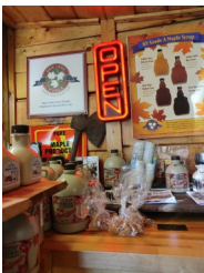
Schoff's Sugar Shack