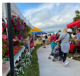
Geneva Farmers' Market