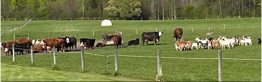
Rosecrest Farm Beef and Goats

Contact: 585-394-5918 or rosecrestfarm@aol.com