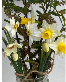
Grimble Hill Farm and Forest

Contact: 585-314-6966 or grimblehillfarm@gmail.com or Grimblehill.com or @GrimbleHillFarm