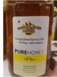
Hungry Bear Farm