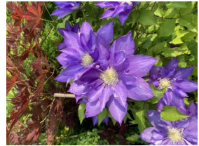
Clematis-Clematis H.F. Young Coldwater Pond Nursery