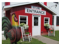
Dudley Poultry Company