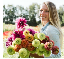
Trademarks Flower Farm