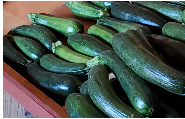
Zucchini (JDs Country Ridge Farm)