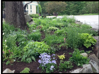
Above: Garden maintained by MG volunteers.

* Includes Smith Lever, Safety Edu. Program, DEC Program, MFO and Farm to School