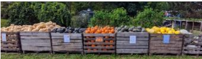
Schlenker Farm Market

Contact: 585-752-5332 or 585-721-1680 or Snuffysfarmmarket@gmail.com www.facebook.com/snuffysfarmmarket