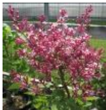
Syringa microphylla superba: Coldwater Pond Nursery