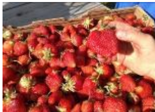
Fish Farm Market