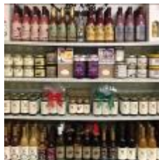
Arbor Hill Grapery