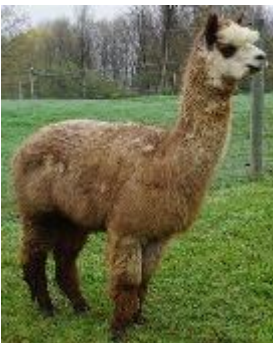
Lazy Acres Alpacas Inc.