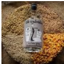
Smokin' Tails Distillery

Contact: 585-880-1776 or Knuckleup@smokintailsdistillery.com www.SmokinTailsDistillery.com