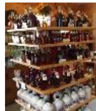
Wohlschlegel's Naples Maple