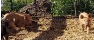
Washburn Produce and Poultry

Contact: 585-229-4925 or washburn_poultry@yahoo.com