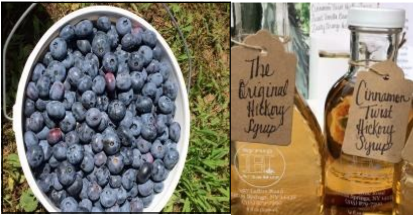
ACMME Farms-Syrup A'LaRue