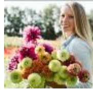
Trademark Flower Farm