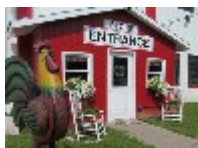
Dudley Poultry Company

Contact: 585-755-0323 or meanttobemeadows@gmail.com www.meanttobemeadows.com