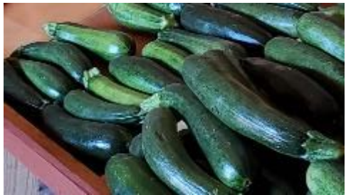
Zucchini (JDs Country Ridge Farm)