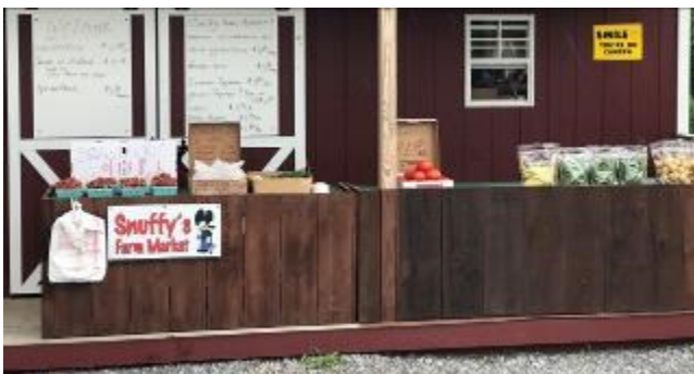
Snuffys Farm Market

Contact: 585-229-4925 or washburn_poultry@yahoo.com