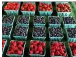
Joseph's Wayside Market