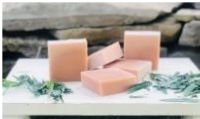
Padelford Brook Farm goat products

Contact: 315-787-0102 or nbaris@redjacketorchards.com www.redjacketorchards.com