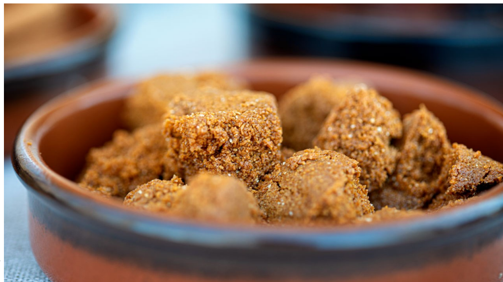
Maple sugar appeals to consumers looking for a local, sustainable, organic sweetener.

"There are endless possibilities," Wightman said. "I think we're at the very tip of the iceberg of where maple sap could end up in value-added products."