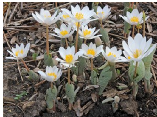
Bloodroot in flower.

Bloodroot ( Sanguinaria canadensis ) is a woodland spring ephemeral that is also happy in the shade garden. Beautiful white blossoms have 8 to 12 petals growing on leafless stems. 'Multiplex' is a stunning double flowered form. They emit a wonderful fragrance that attracts many kinds of native bees. A light green leaf is wrapped around the