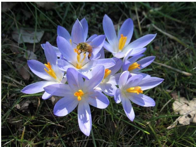
A "Tommie" being visited by a bee.

Among the first crocus to bloom, Crocus tommasinianus bloom about 2 weeks earlier than the larger Dutch crocus. The blooms are pale lilac to deep reddish-purple with a white throat and a silvery exterior.