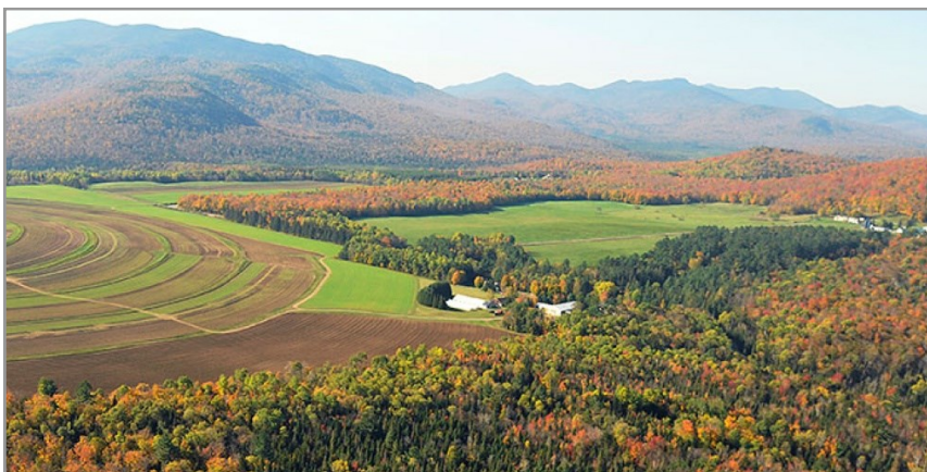
Cornell's Uihlein Farm—maple production research headquarters