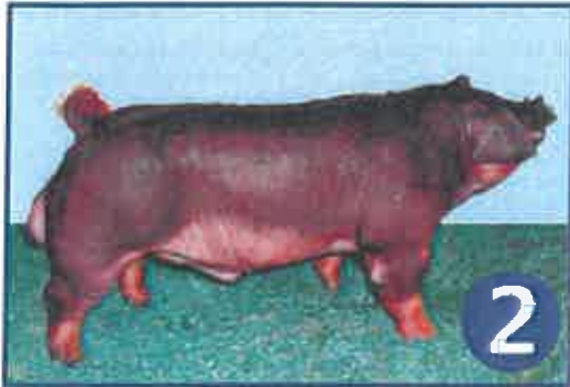
Actual Data: 150 DAYS to 250, 8.7 LEA, .72 BF, 117 TSI, 4.6 IMF