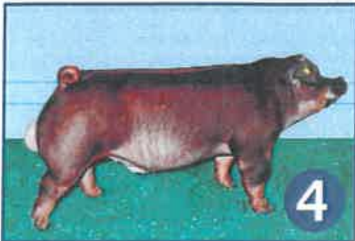
Actual Data: 152 DAYS to 250, 8.5 LEA, .70 BF, 115 TSI, 4.2 IMF