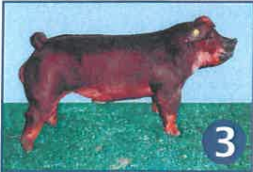
Actual Data: 161 DAYS to 250, 8.2 LEA, .64 BF, 112 TSI, 3.1 IMF