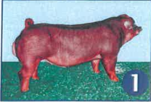
Actual Data: 159 DAYS to 250, 7.9 LEA, .86 BF, 109 TSI, 2.3 IMF

Scenario: Rank these boars as they should be selected by a purebred Duroc producer. The primary goal of this producer is to generate fast growing market hogs with the end goal of marketing Certified DUROC® Pork to local restaurants and markets. This producer also has a strong custom pork clientele that covets the Certified DUROC® Brand.