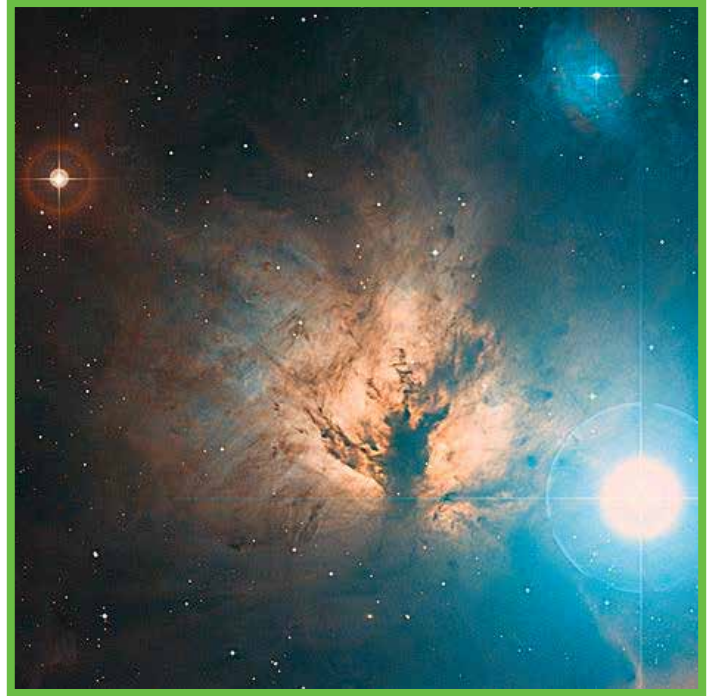
The Flame Nebula

Nebulae (the plural form of nebula) are formed from the collapse of gases or supernova explosions, and can be trillions of miles across. Nebulae often get their names from their shapes. Some examples are Horsehead Nebula and Crab Nebula. Stars, which are spheres of plasma bounded together by gravity, are formed inside nebulae.