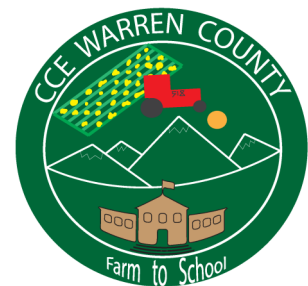
3rd Place was submitted from Southern Adirondack Education Center