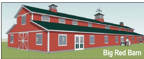
Big Red Barn