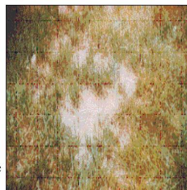
Figure 3. Melting out in a home lawn

Diseased turf may have a yellow then brown or drought-injured appearance (Figure 3). The damaged areas may be small and circular to large and irregular with entire stands of bluegrasses, fescues, ryegrasses, Bermuda grasses, or bentgrasses thinned out or completely destroyed by severe crown and root rot. This phase occurs most readily when plant vigor is suppressed by one cause or another, particularly during hot weather.