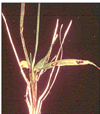
Figure 2: Helminthosporium crown and root rot

This phase of the disease usually appears first in warm to hot, dry weather as a reddish brown or purplish black decay of the stem, crown, rhizome, stolon, and root tissues (Figure 2), sometimes turning reddish brown to chocolate brown or black when invaded by secondary bacteria and fungi. The feeding roots on diseased plants are shallow, few in number, or even absent. Such plants lack vigor and often wilt during mid-day, even when soil moisture is abundant.