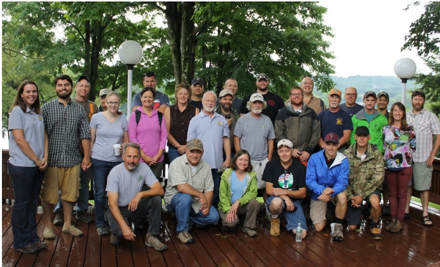
Pictured here are Armed to Farm participants from an August event in Madison County, NY.