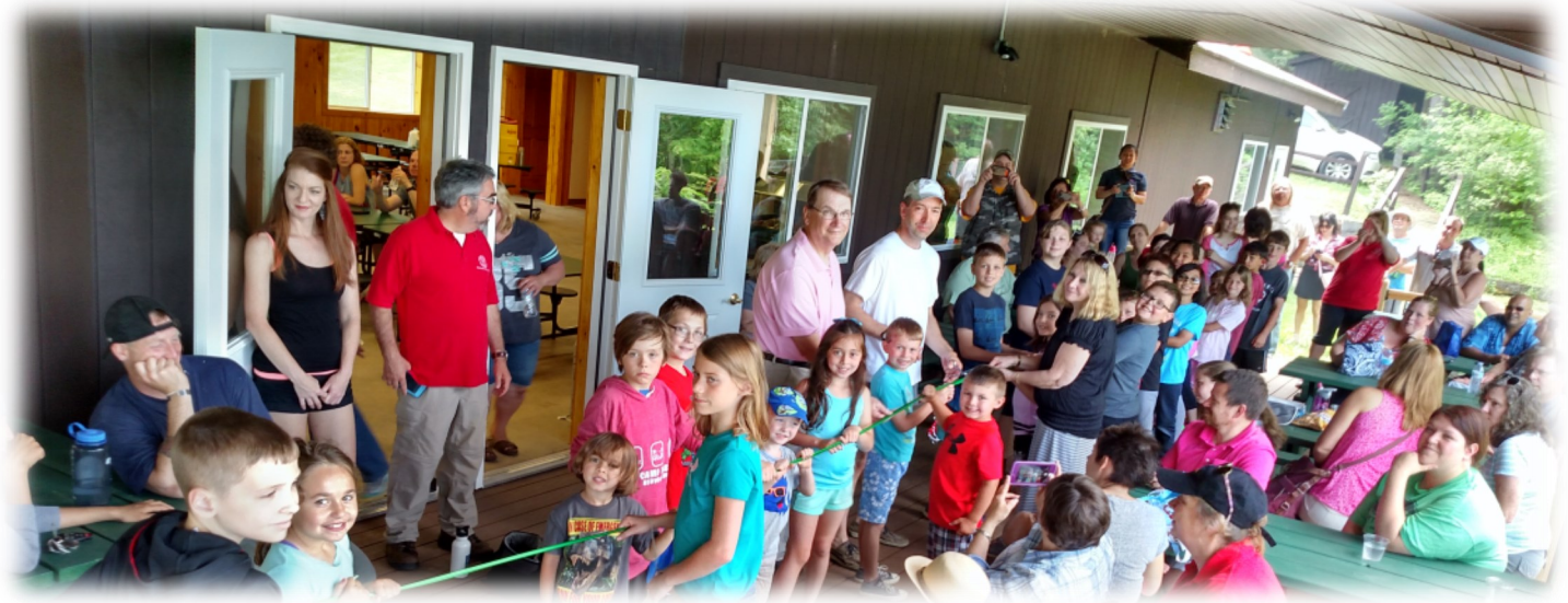
Ribbon-cutting event for new covered deck at 4-H Camp Wabasso. Thank you to all our donors who helped make this project possible!

4-H Animal Science and Club Support 4-H Camp Wabasso Belleville-Henderson Extended School Day Program Carthage High School STEM Program Indian River School District Family Liaisons Lyme Extended School Day Program Parenting Education Watertown Wiley Afterschool Programs