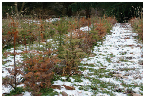
Detailed example of Phytophthora root rot

Growers are welcome to bring along their own weed samples or pictures for identification and management recommendations.