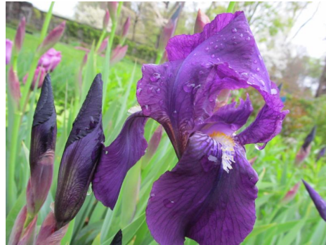
Iris at the Beatrix Farrand Garden

Green Teen has been working hard this spring season. We're getting all three of our urban gardens prepared and planted, and have had two guest artists work with us to make zines and learn more about photographing gardens. We'd love to show off the fruits of our labor in a couple different ways. Please feel free to visit our gardens in the City of Beacon if you are in town. One is directly next to Tito Santana Taqueria (142 Main Street), another is at the Main Street Pop Up Park (on the corner of Main and Cross Streets), and our oldest garden is located at the Beacon Recreation Center (23 West Center Street). Our photographs and zines, accompanied by the Green Teens, will be on display during the Bellefield Design Lectures at the Henry A. Wallace Visitor Center in Hyde Park. We hope to see you around!