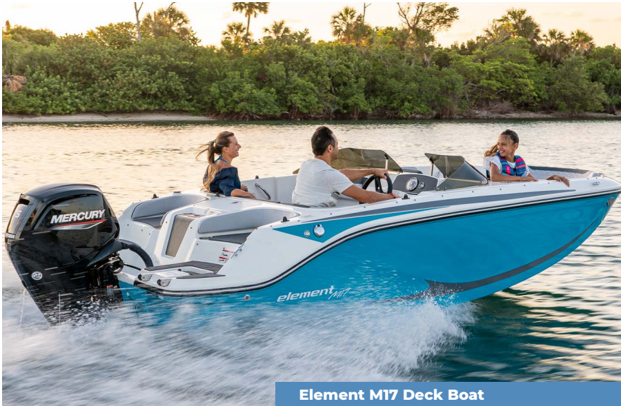
Element M17 Deck Boat