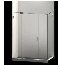
950 - Door & Panel w/ Return Panel Celesta, Dresden, Tresor Geolux, Vonse Rolaire, Evo Preceria