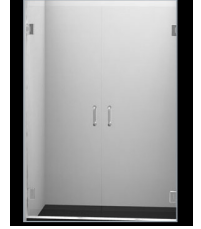
922 - French Doors Celesta, Dresden, Tresor