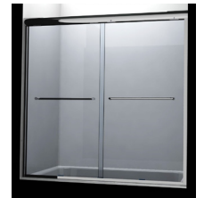
2850 (Tub) 3850 (Shower) Double Sliding Doors Celesta