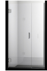
935 - Door & Panel Celesta, Dresden, Tresor, Vinesse, Vinesse Lux Cantour, Evo, Rolaire Geolux, Vonse, Preceria