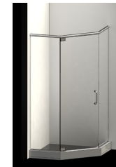
960 - Neo Angle Celesta Dresden Tresor