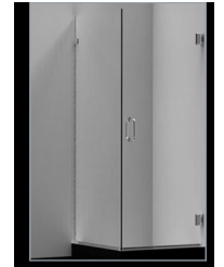
945 - Door & Return Panel Celesta, Dresden, Tresor