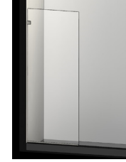
910/920/930 - Shower Screen Celesta, Geolux