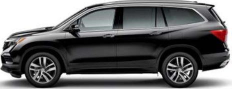
TOURING & ELITE