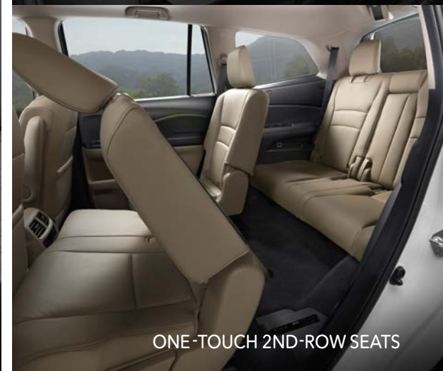
ONE-TOUCH 2ND-ROW SEATS