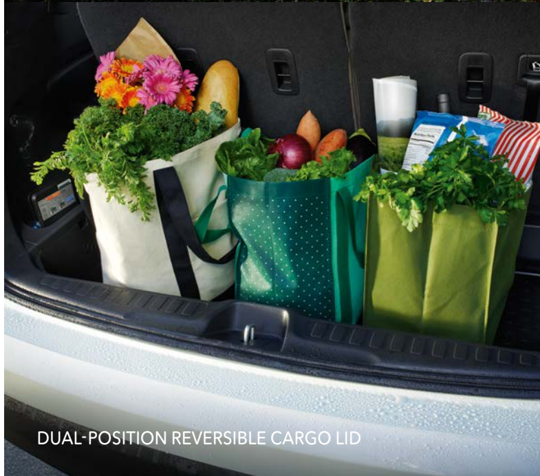
DUAL-POSITION REVERSIBLE CARGO LID