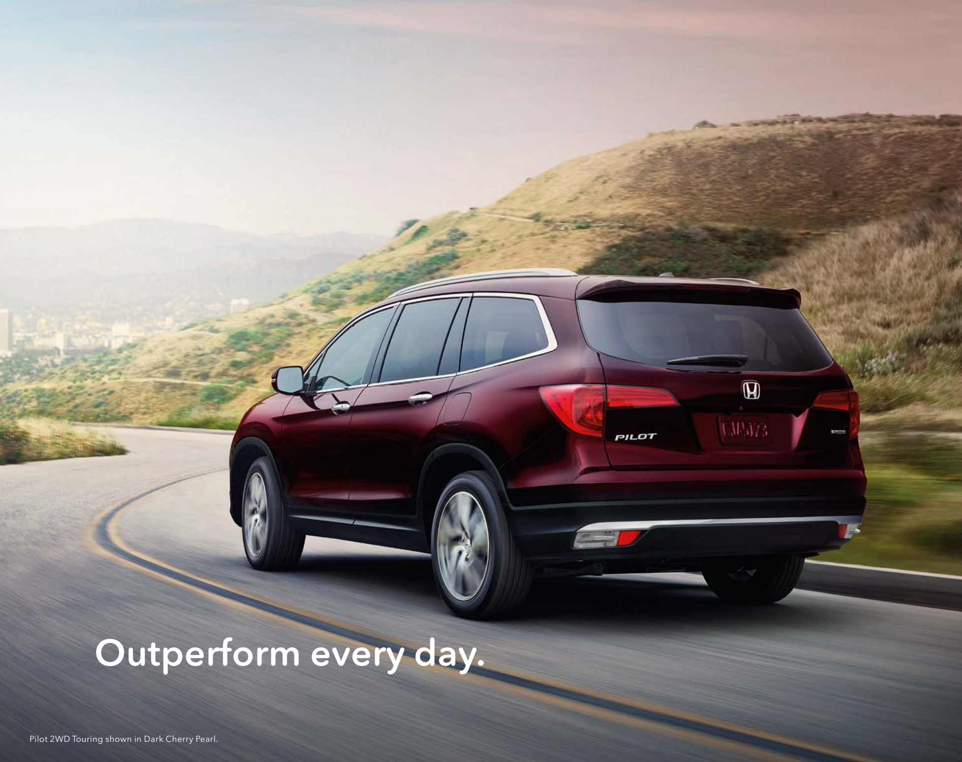
Pilot 2WD Touring shown in Dark Cherry Pearl.