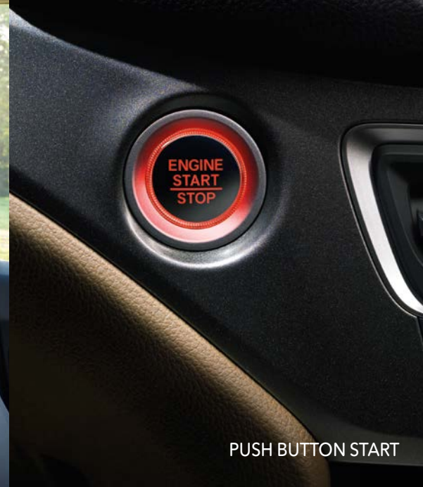
PUSH BUTTON START