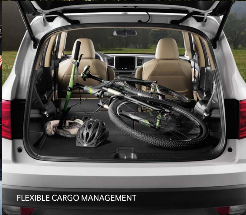
FLEXIBLE CARGO MANAGEMENT

*Honda reminds you to properly secure items in the cargo area.