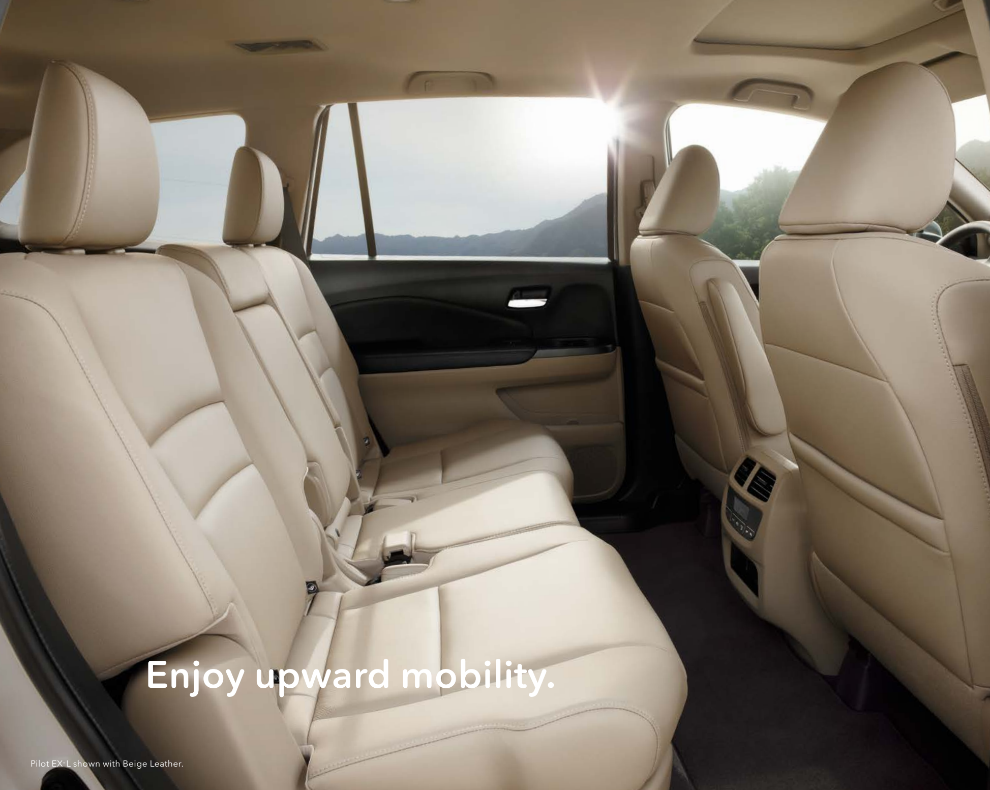
Pilot EX-L shown with Beige Leather.