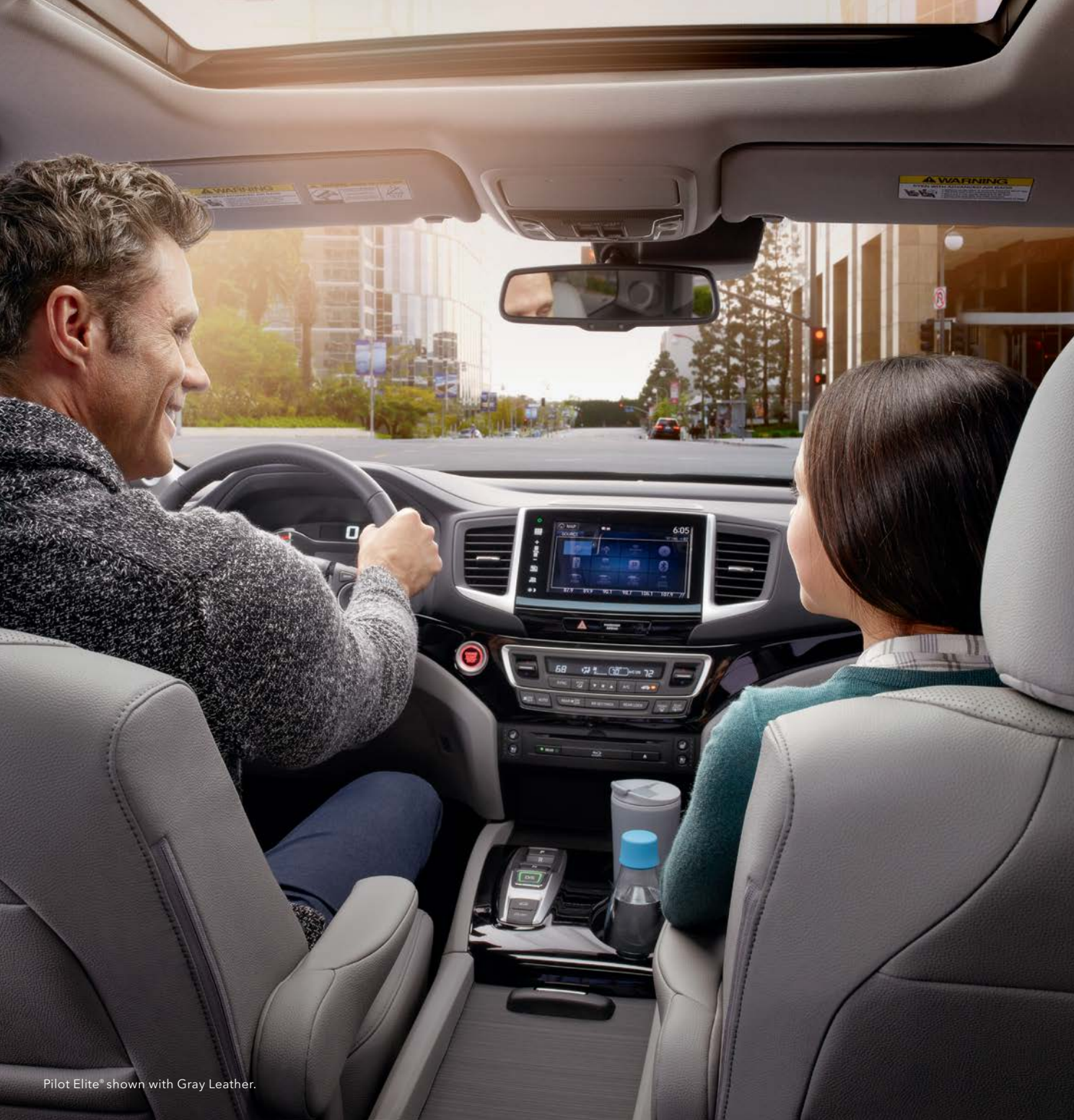
Pilot Elite® shown with Gray Leather.