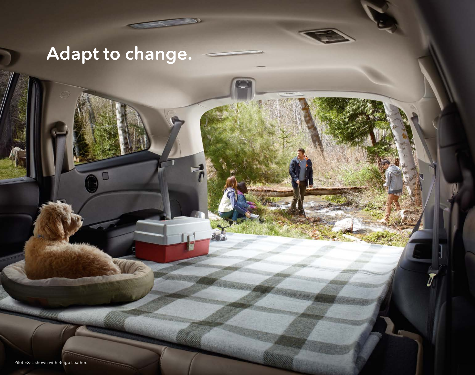
Pilot EX-L shown with Beige Leather.