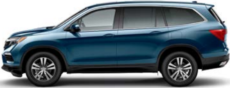
EX & EX-L