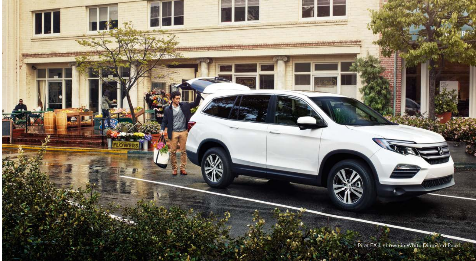
Pilot EX-L shown in White Diamond Pearl.