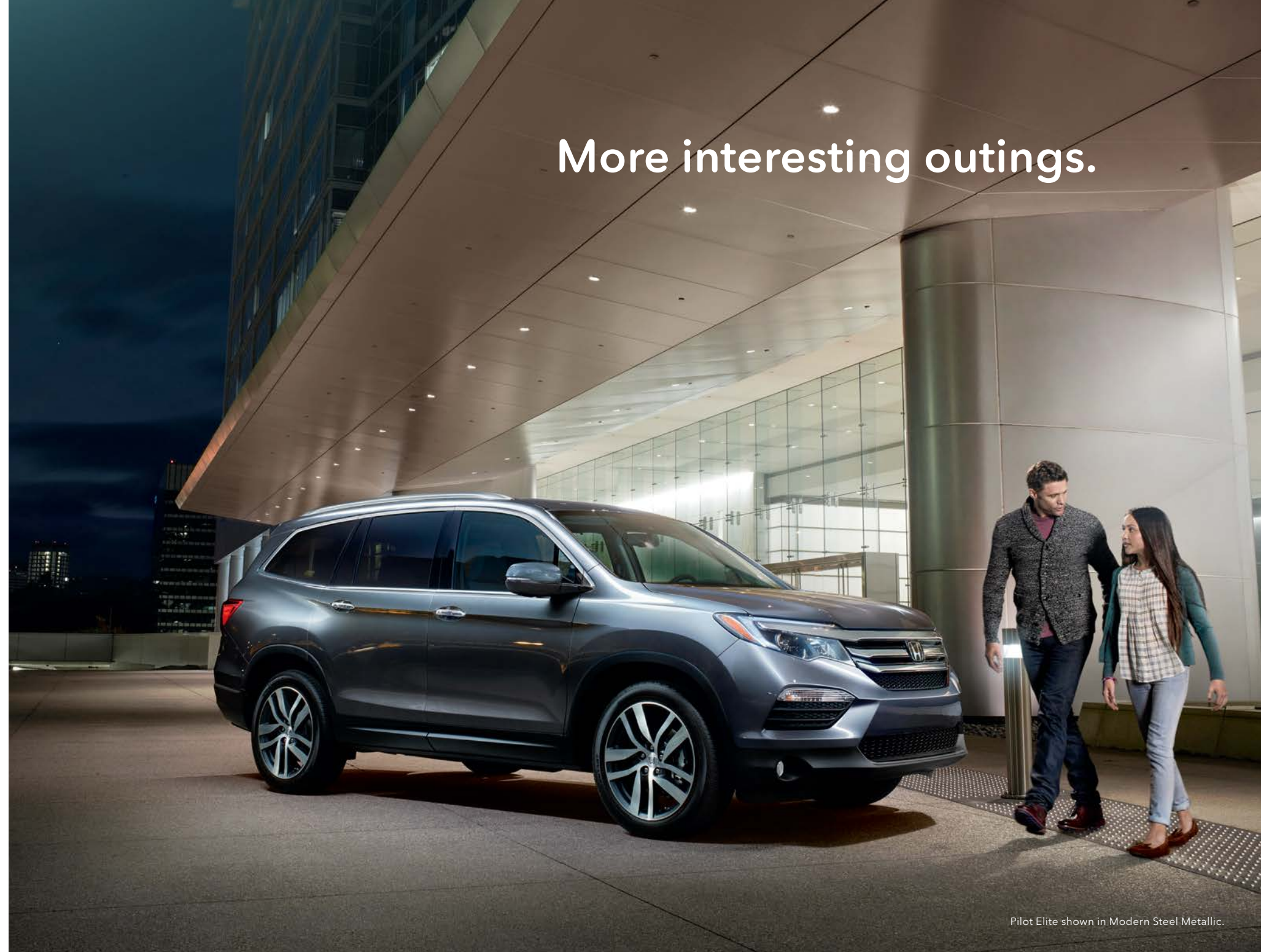
Pilot Elite shown in Modern Steel Metallic.