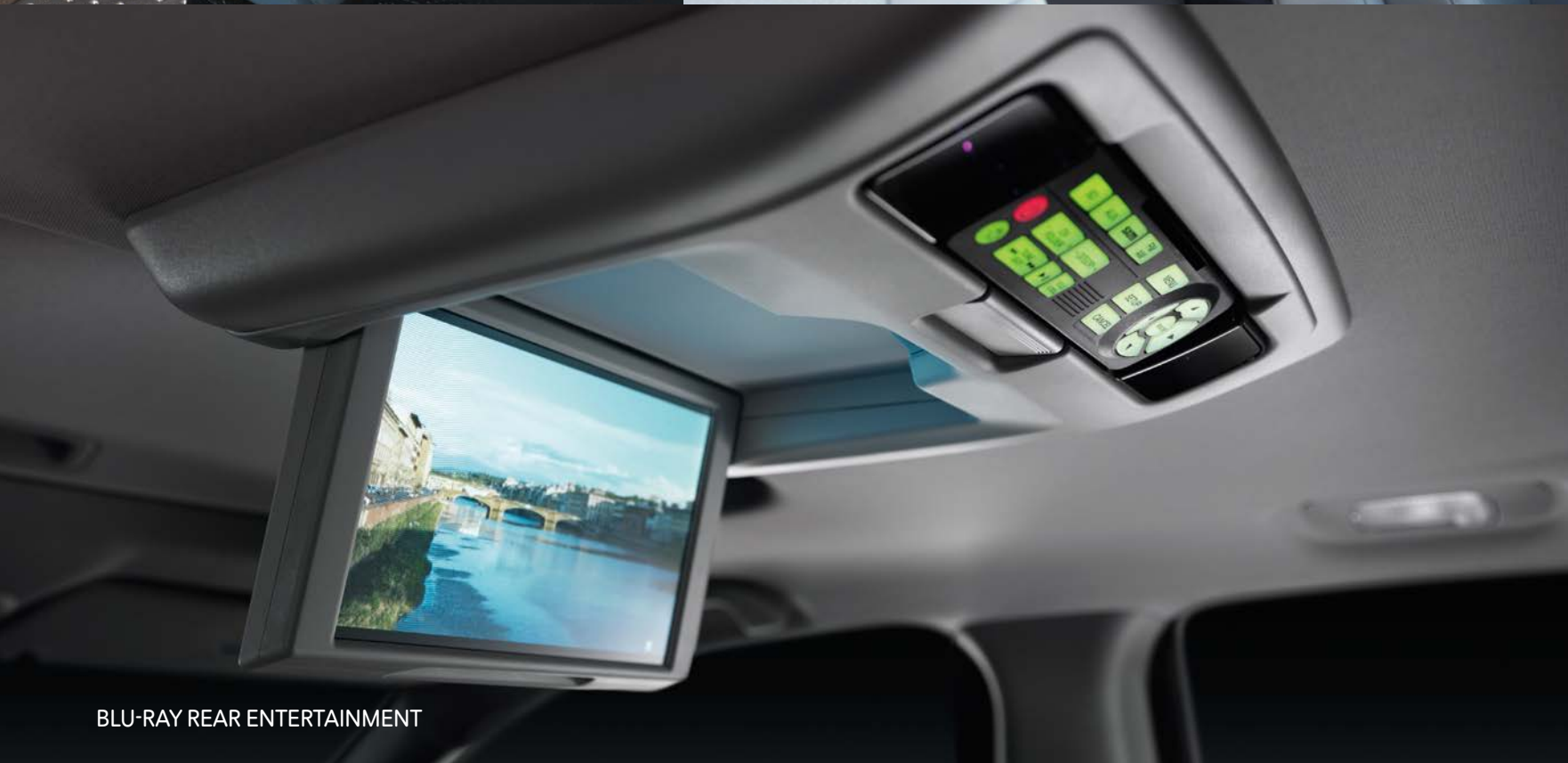
BLU-RAY REAR ENTERTAINMENT