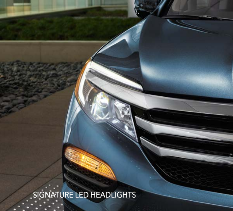
SIGNATURE LED HEADLIGHTS