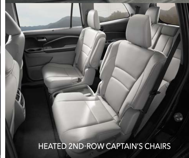
HEATED 2ND-ROW CAPTAIN'S CHAIRS