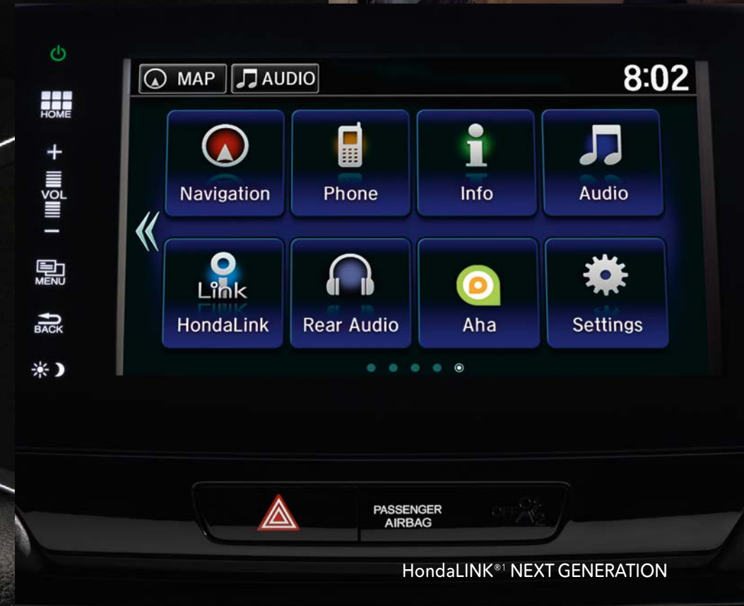
HondaLINK®1 NEXT GENERATION