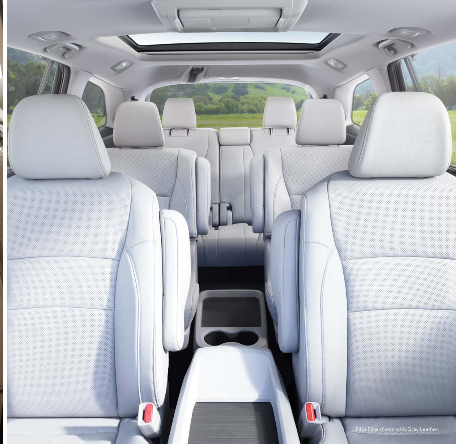
Pilot Elite shown with Gray Leather.