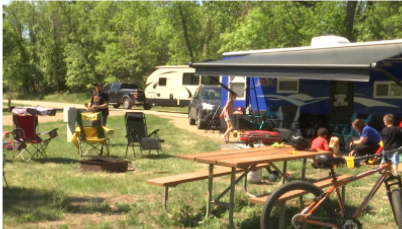
More people visiting state parks over past year