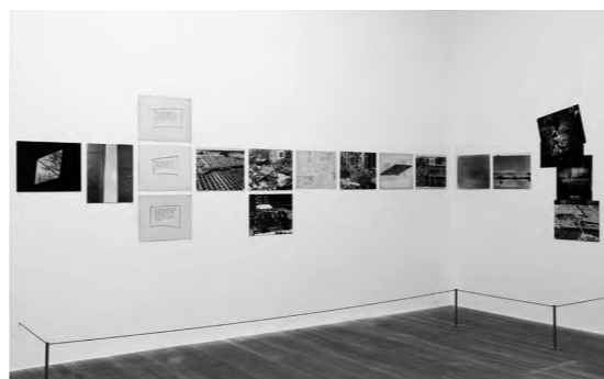
Figure 3. Installation view of Anarchitecture in Open Systems: Rethinking Art Since 1970 , Tate Modern, London, 2005

year, in a kind of Freudian slip: 'The Anarchitecture show at 112 Greene Street last year – which never got very strongly expressed – was about something other than the established architectural vocabulary, without getting fixed into anything too formal.' Asked if he considered his project Splitting – his cut into a building on Humphrey Street in Englewood, New Jersey – as a piece of anarchitecture, he replied: No. Our thinking about anarchitecture was more elusive than doing pieces that would demonstrate an alternate attitude to buildings, or, rather to the attitudes that determine containerization of usable space. [...] We were thinking more about metaphoric voids, gaps, left-over spaces, places that were not developed. [...] Metaphoric in the sense that their interest or value wasn't in their possible use [...] on a functional level that was so absurd as to ridicule the idea of function.