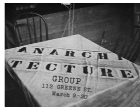
Figure 1. Invitation to Anarchitecture exhibition, 1974