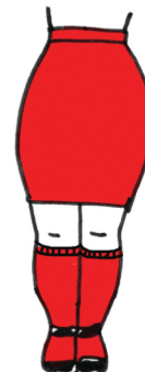
Pencil Skirt With Knee Socks