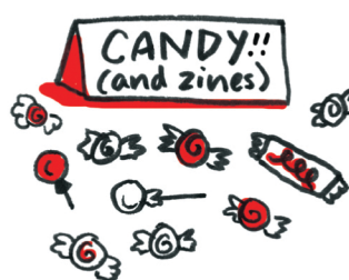
Bribe Bowl of Candy at Small Press Table