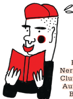
Fan Nervously Clutching Author's Book