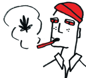
Touring Author Discreetly Vaping Weed