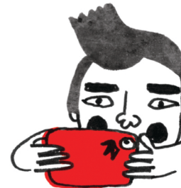
Byron Beck Taking Your Picture