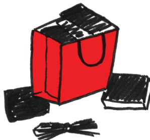
Bag Way Too Full of Books