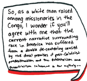
Fan Trying to Impress Ta-Nehisi Coates With Insightful Question