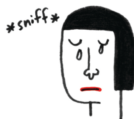
Person Softly Crying During Lidia Yuknavitch's Talk