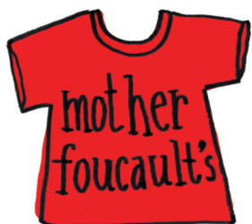
Mother Foucault's T-Shirt