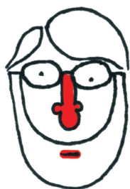
Guy Who Looks Like Chuck Klosterman but Isn't