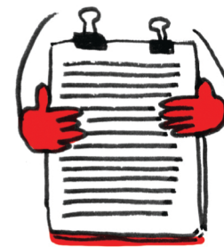
Hopeful Writer Carrying Manuscript