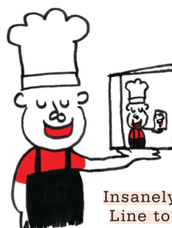
Insanely Long Line to Meet Cookbook Chef