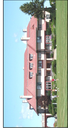
Mansion at Ocean Edge Resort, Brewster, MA