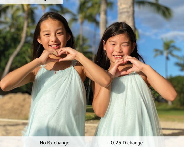
No Rx change