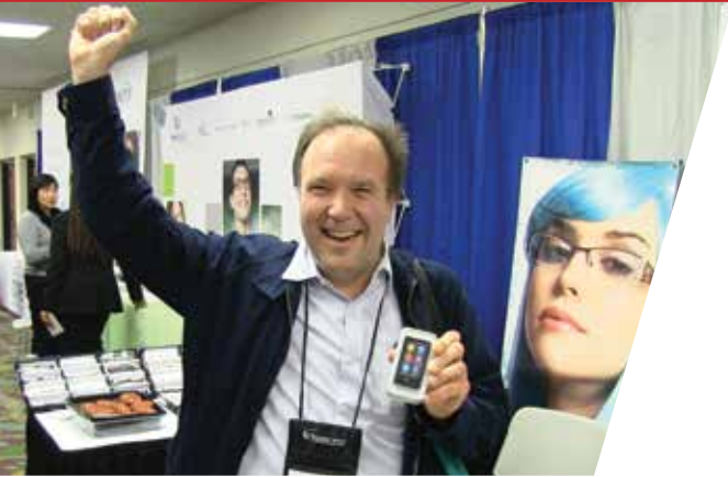
EXHIBIT HALL HOURS