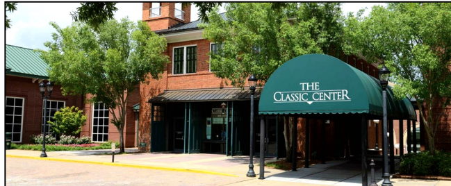
THE CLASSIC CENTER

Registration fees DO NOT include SOPO dues. By registering for this event, I agree to comply with all seminar and lodging cancellation policies.