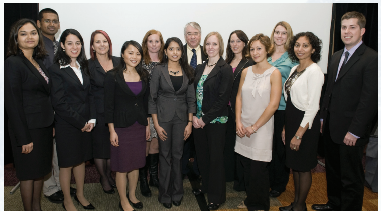
2010 William C. Ezell Fellowship Recipients