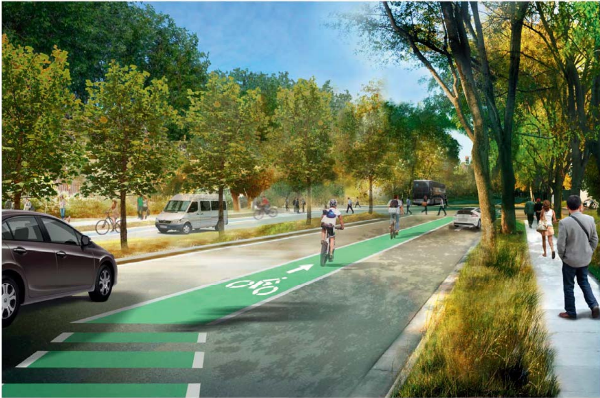
01 Proposed North Tantau Avenue Enhancements no scale

W:\CADD\02_Publications\02_Sheets\35-08.dwg 11/20/13 4:27:31 PM