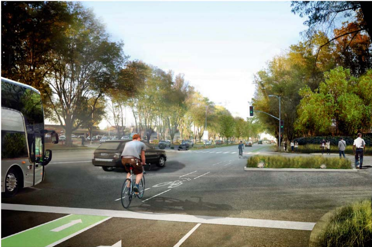
03 Proposed North Wolfe Road Enhancements no scale