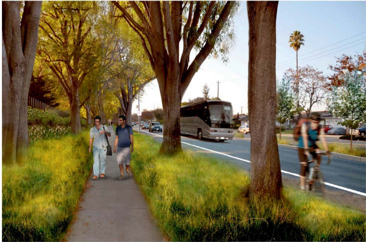
02 Proposed East Homestead Road Enhancements no scale