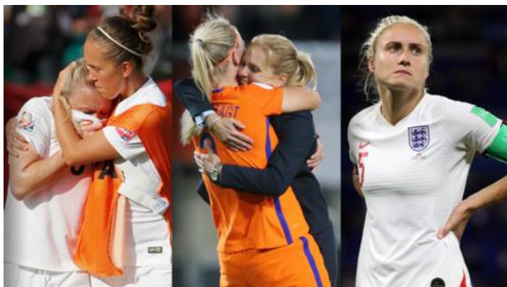
England's lessons from past semi-final defeats

Former England goalkeeper Karen Bardsley reflects on the team's past semi-final defeats as they prepare to take on Sweden.