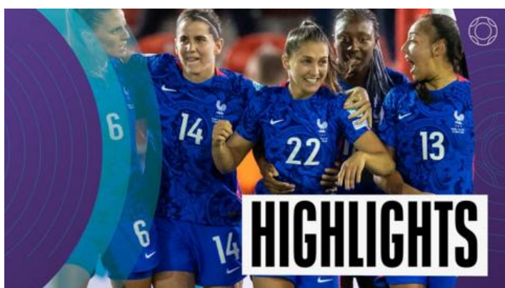
France through to first Euros semi after Netherlands win