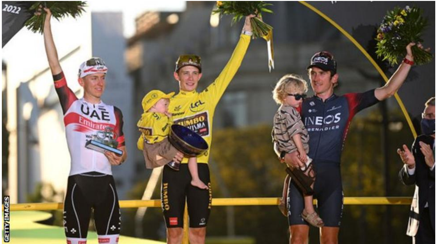
Geraint Thomas' team Ineos Grenadiers won the best team award

Welshman Thomas, the 2018 champion and 2019 runner-up, said he was "satisfied" after "proving a few people wrong" with his performance at this year's Tour.