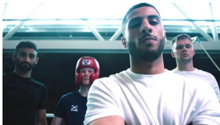
Olympic champion Yafai meets boxing's future stars