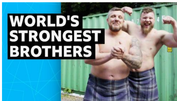
Watch: World's strongest men try Commonwealth Games sports