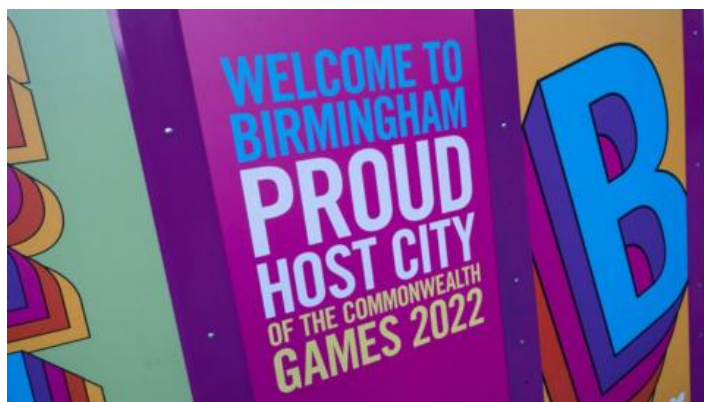
Birmingham 2022 - how green are the Games?