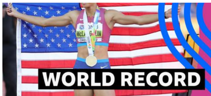
'She's unbeatable' - McLaughlin smashes world record in 400m hurdles