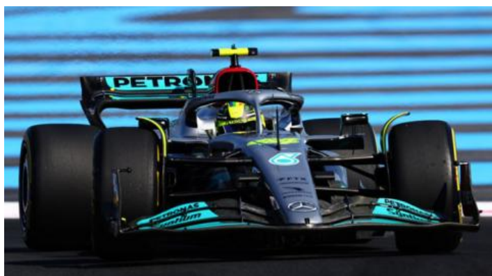
Mercedes' qualifying pace 'a slap in the face'