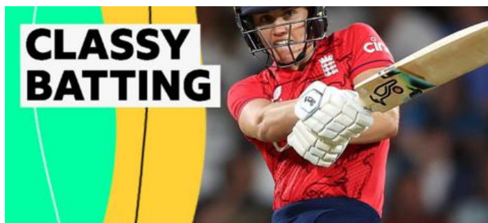
Destructive batting performance gives England victory over South Africa