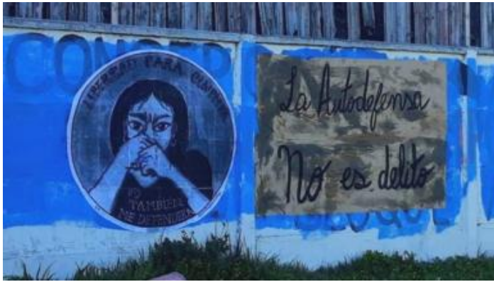
'I'd Defend Myself, Too': Chileans back abuse survivors