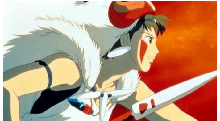
The animation too dark for Hollywood

Most of us don't clean our teeth in the right way