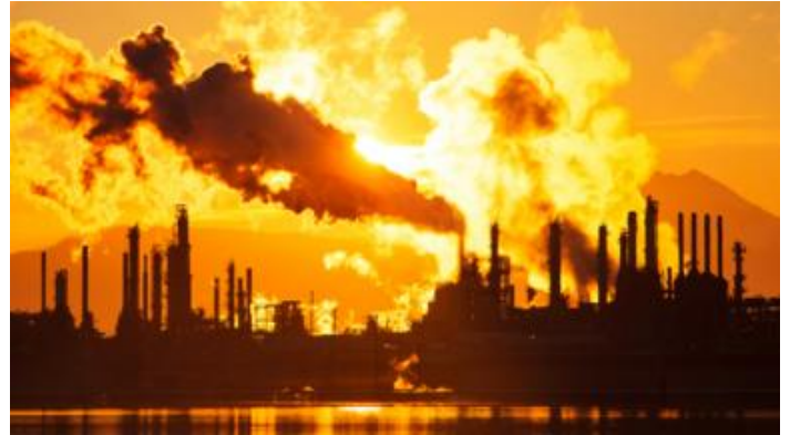
The audacious PR plot that spread climate change doubt