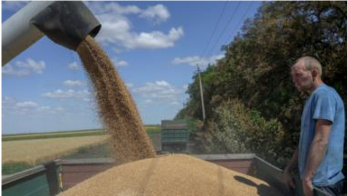
How much grain is stuck in Ukraine?