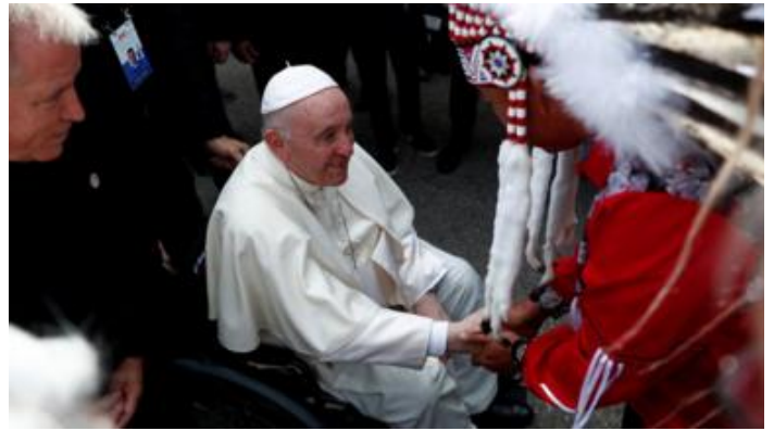
The Pope's 'pilgrimage of penance' to Canada