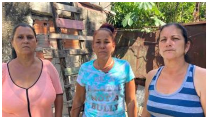
Mothers' pain over harsh jail for Cuban protesters