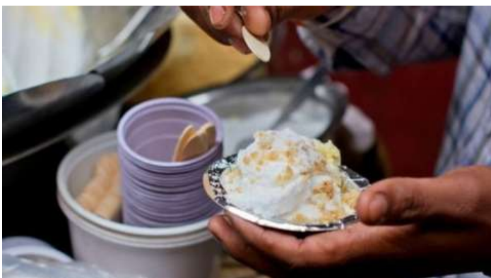
Delhi's opulent 'snack of wealth'

Why dark Japanese fairy tale Princess Mononoke was too much for Hollywood