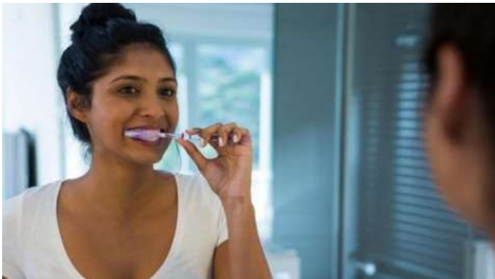
Why we brush our teeth wrong

Most of us don't clean our teeth in the right way