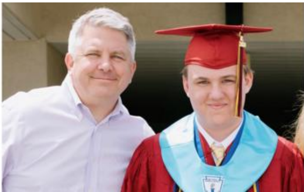
How to talk to a climate change denier